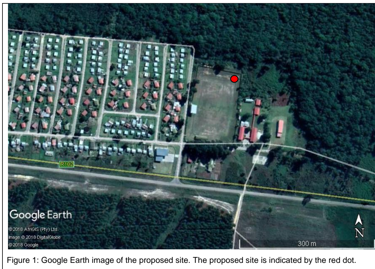
Figure 1: Google Earth image of the proposed site. The proposed site is indicated by the red dot.