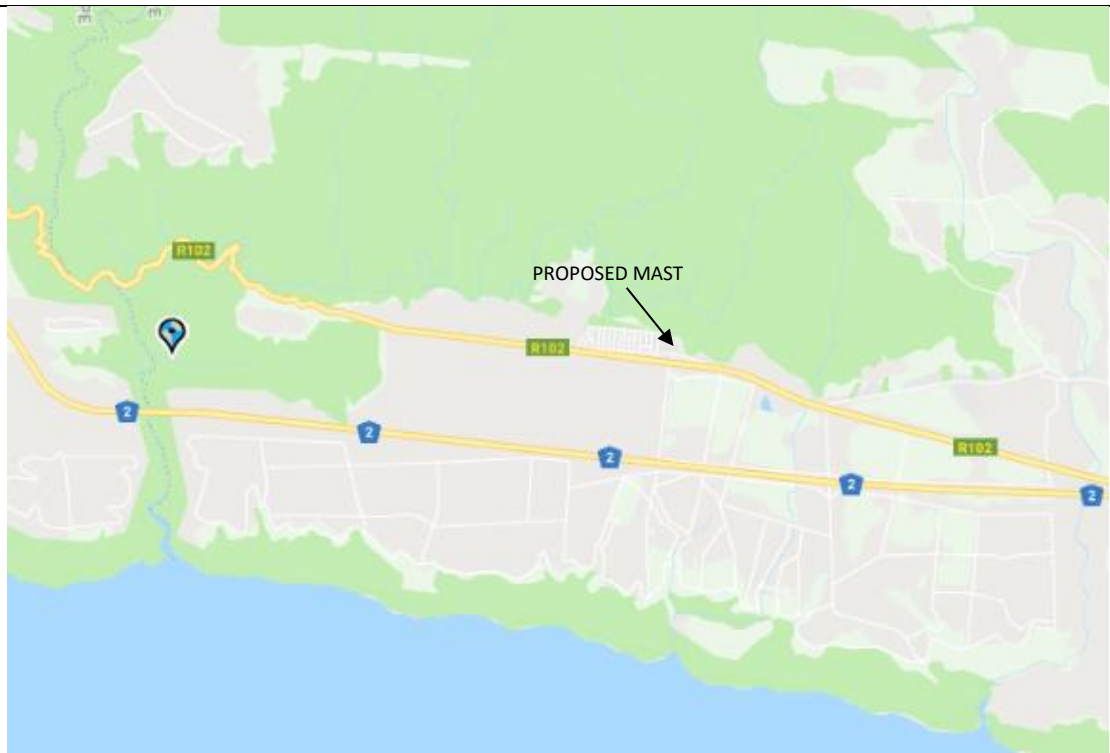
Figure 5 - Cell C Coverage Map: LTE (No LTE Coverage)

Indicate any benefits that the activity will have for society in general: