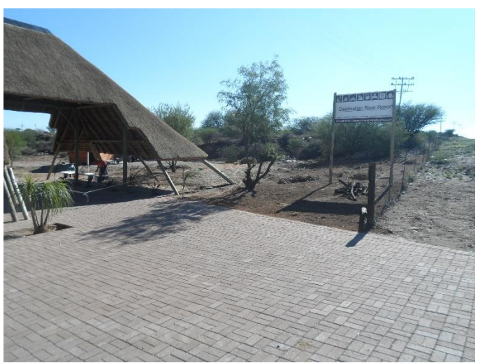
Photo 2: Newly constructed thatched roof at the Property entrance (taken from position 1)