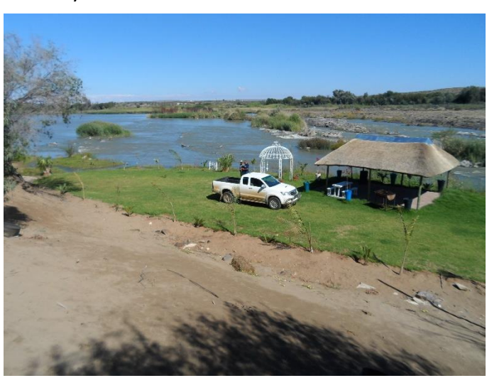
Photo 14: Thatched gazebo constructed on river bank (taken from location 8)