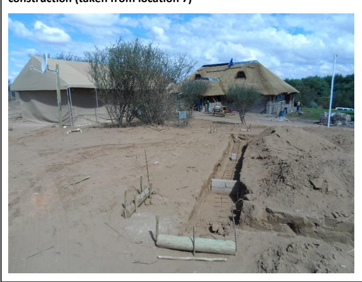
Photo 11: Main area and some accommodation units under construction (taken from location 7)