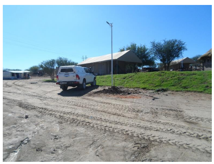
Photo 4: Entrance road and completed units (taken from position 2)