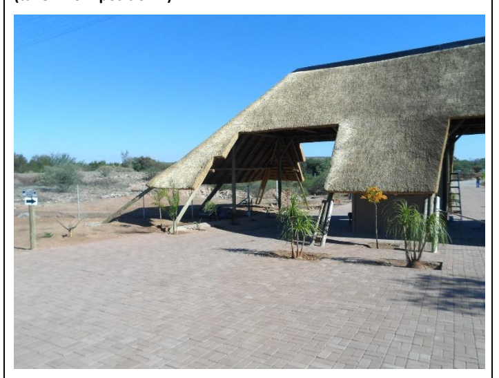
Photo 1: Newly constructed thatched roof at the Property entrance (taken from position 1)