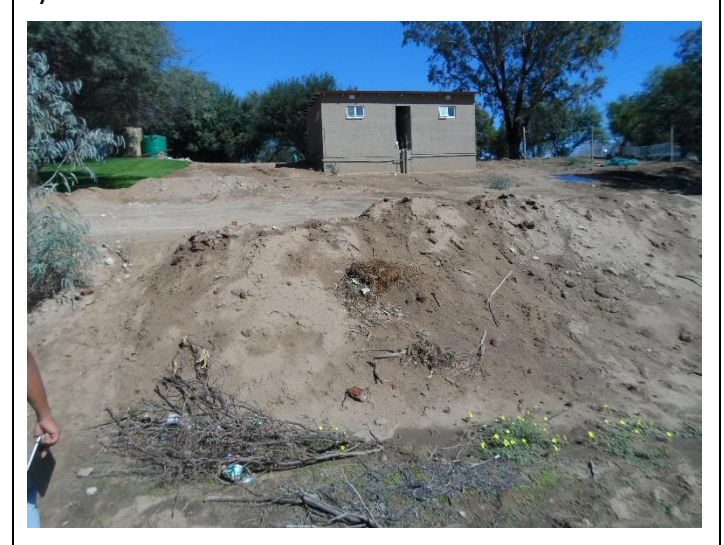
Photo 7: Ablution facility with conservancy tank (taken at location 4)