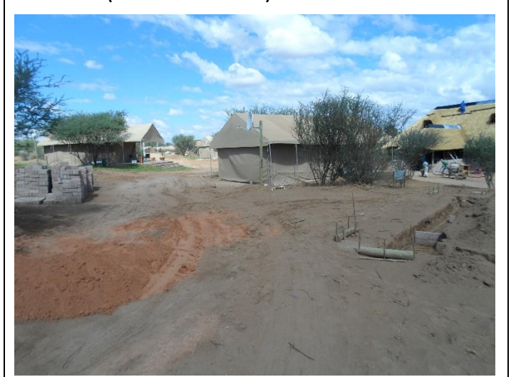
Photo 13: Main area and some accommodation units under construction (taken from location 7)