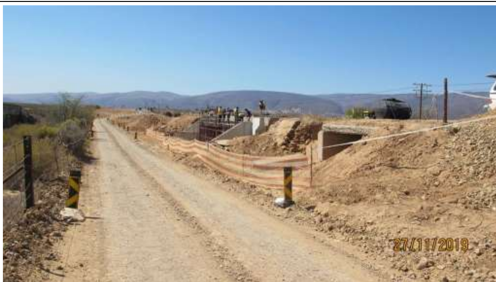
Photo 13: Bridge rehabilitation in progress, with the bypass road to its left