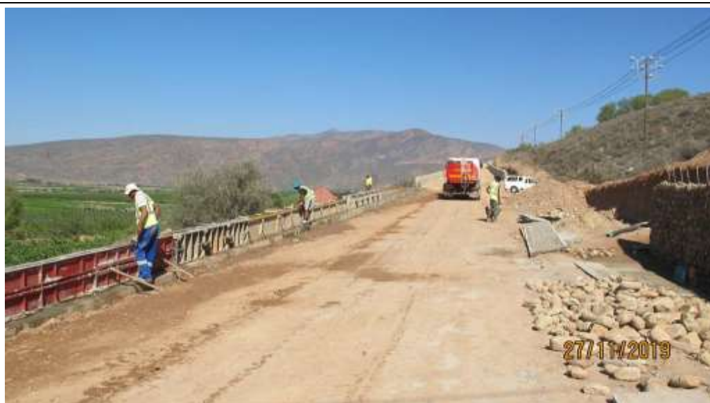
Photo 3: Construction progress DR1699 (not applicable to this report)