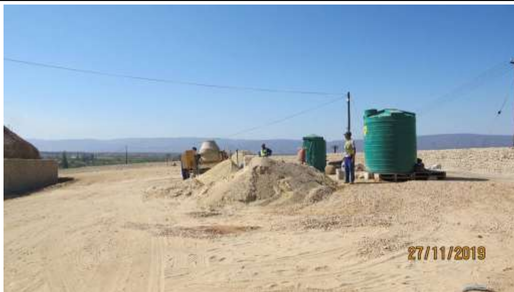
Photo 2: Construction progress DR1699 (not applicable to the this audit report, but included to give the full picture of construction progress)