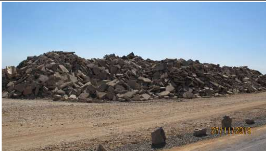
Photo 7: Stockpile area one, next to the DR1688. The cement would be crushed and used as subbase along the road