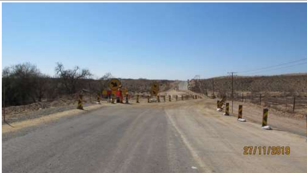
Photo 5: DR1688, construction activities and by-pass road at the first bridge from Calitzdorp direction