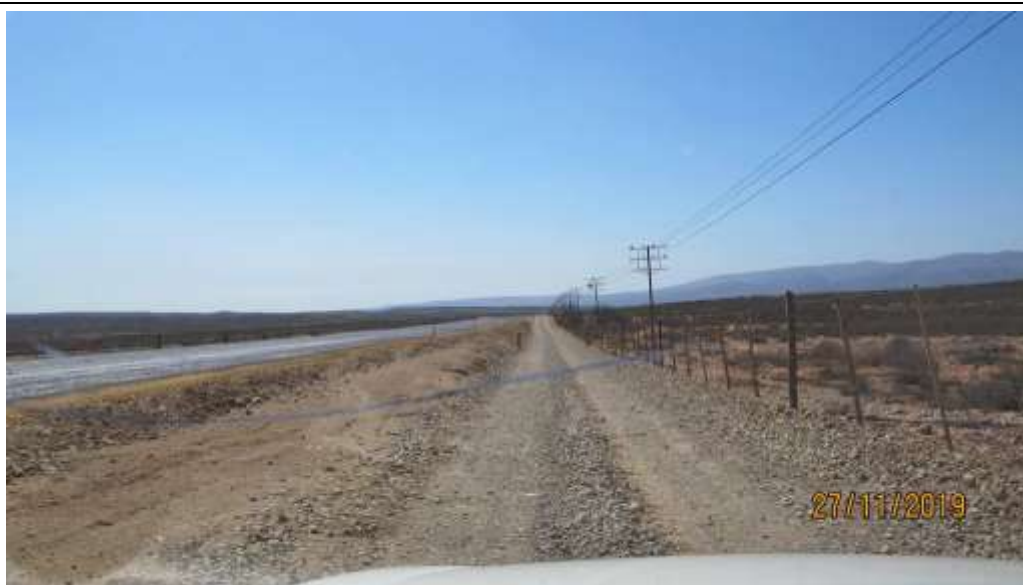
Photo 10: A portion of the construction area, showing the DR1688 to the left, with the bypass road next to it.