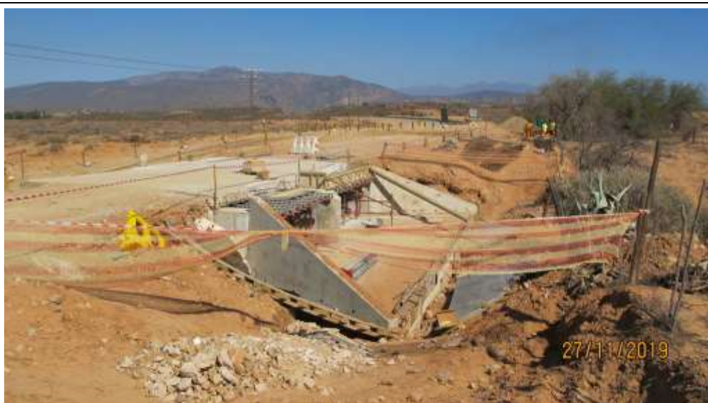
Photo 6: A closer look at the bridge rehabilitation in progress.