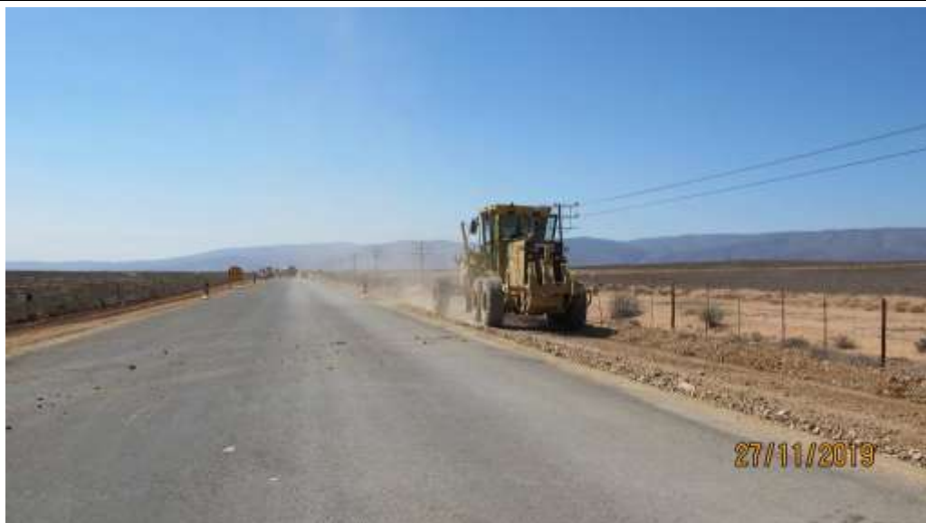
Photo 11: The grader re-shaping the road shoulder. In areas like these, topsoil must be removed beforehand and replaced afterwards.