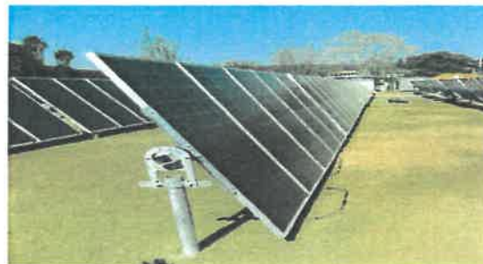
Figure 1: Single axis solar PV module tables raised 500mm above ground level (to a maximum tilt height of 3m). Proposed associated infrastructure includes a fenced construction staging area, a maintenance shed, inverter-transformer stations on concrete pads, office buildings and maintenance shed/s, a switch panel for connection to the power grid, all within the 218ha site.

It is proposed that the powerlines within the facility, as well as the approximately 22kV powerline/s used for evacuation of electricity from the solar PV facility to connect or tie the proposed development in to Eskom's larger kilovolt powerlines feeding into Perseus substation, be underground/sub-surface up until the point of tie-in to the national grid. Eskom's Perseus substation is located about 7km south-east of the proposed development site, as the crow flies but the length of the evacuation/tie-in power line (following the predetermined routes as negotiated with Eskom and landowners must still be finalised.