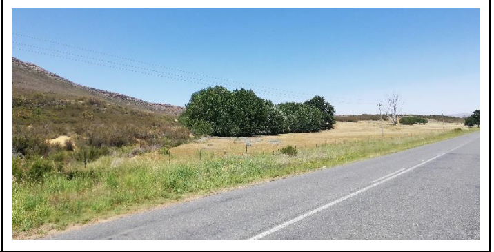
Photo 12: Taken from point 7, within the stand of Blue gums that will be removed during dam wall construction