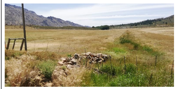
Photo 11: Taken from point 6, looking north-east at the proposed dam wall site from the R303