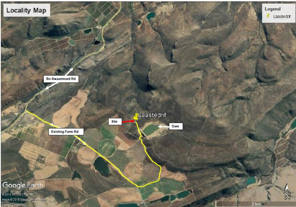
Figure 1: Google Earth aerial view of the site location (yellow placemark). The site is located to the east of Bo-Swaarmoed Road and access to the site will be gained via an existing access road on the property.