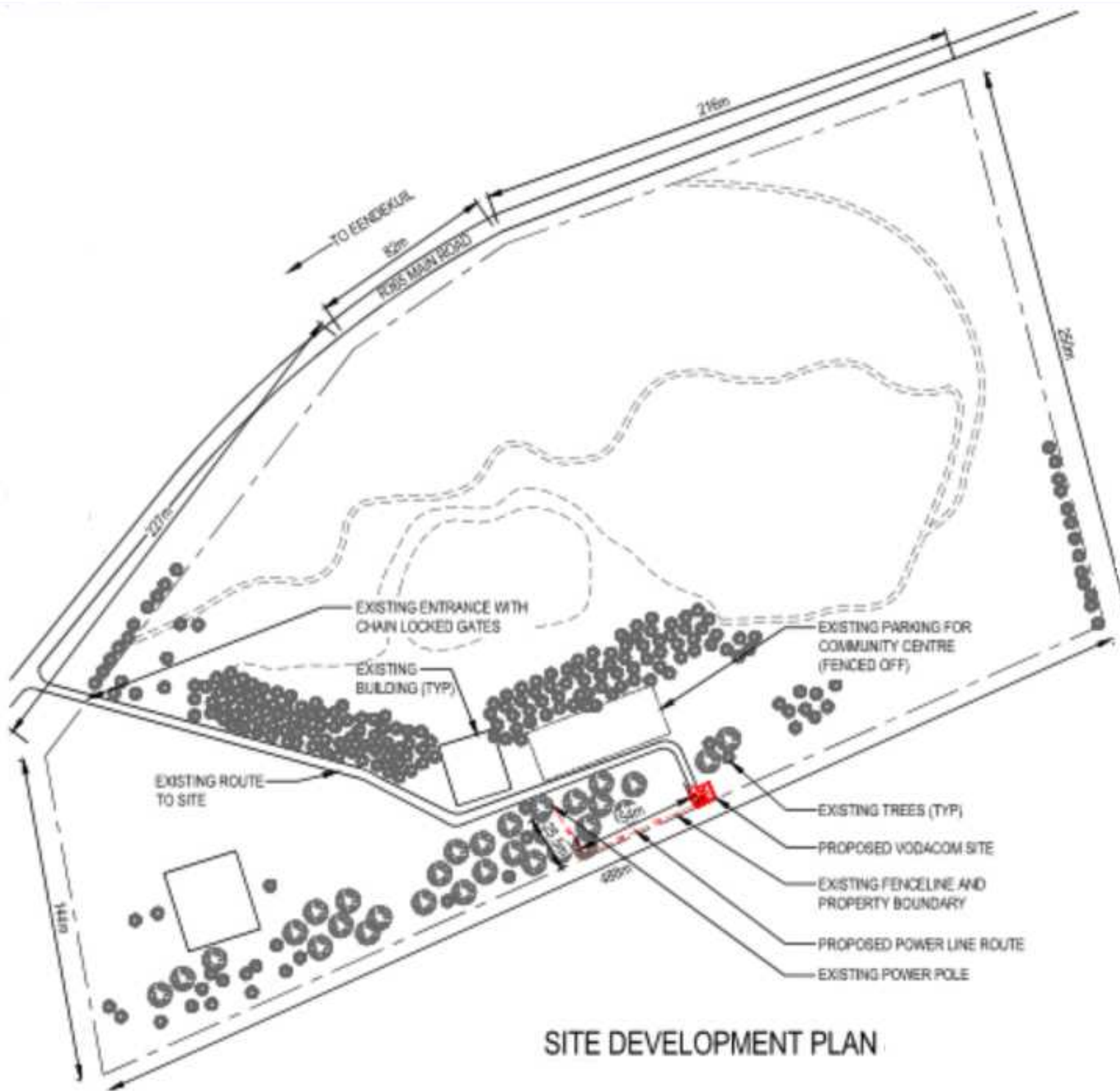
SITE DEVELOPMENT PLAN

Scale: NTS GENERAL LAYOUT SHEET 3 OF 5 Drawing Reference: ETSA-0927 REVISION: A