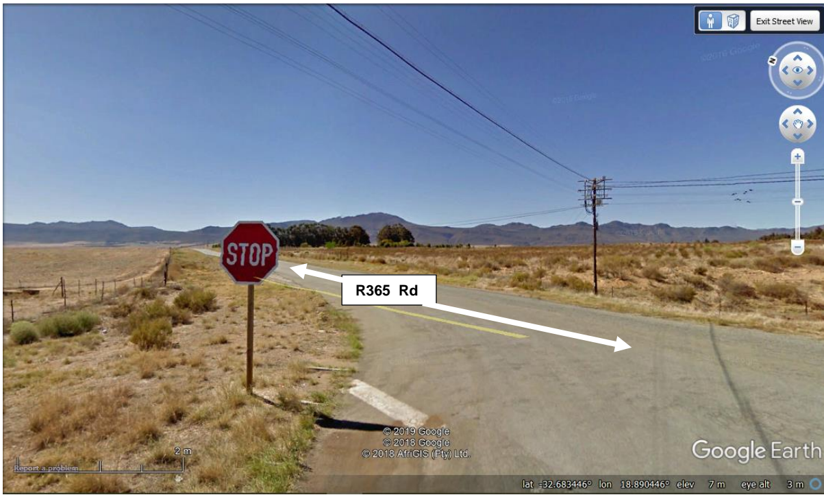
Figure 7: Google Earth view of the proposed site (red arrow), looking in a north-eastern direction as viewed from the corner R365 and Meul Street. The proposed site is surrounded by some mature bluegum trees, which act as some visual screening. The site is generally surrounded by agricultural land uses.