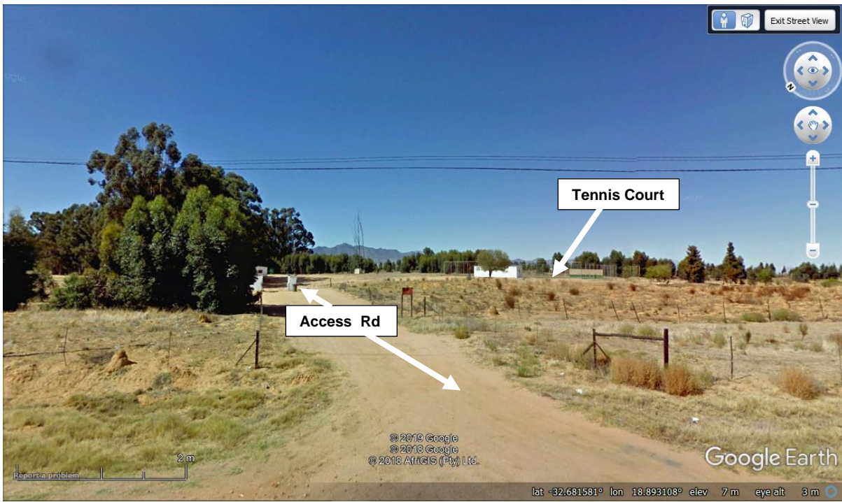
Figure 3: Google Earth view of the access road to the site as viewed from the R365 road, looking in a south-eastern. The tennis court is located approximately 195m west of the proposed site.