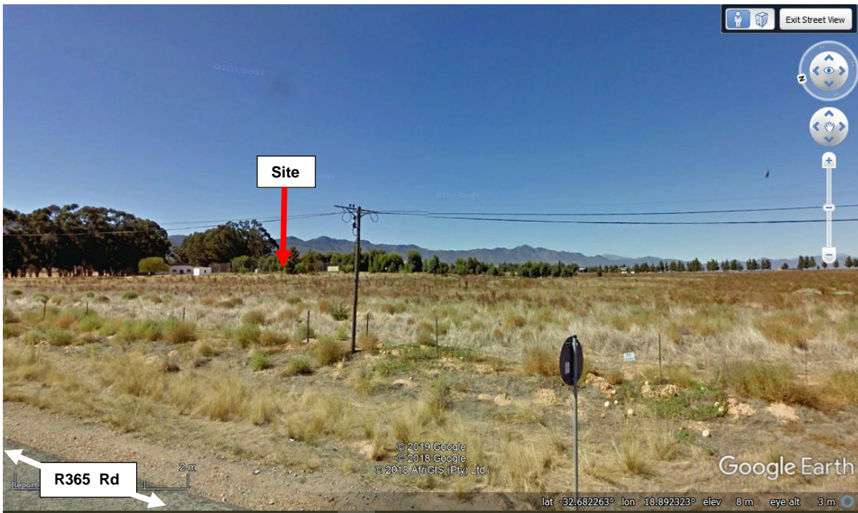
Figure 5: Google Earth view of the proposed site (red arrow), looking in a south-eastern direction as viewed from the R365 Road. The proposed site is surrounded by some mature bluegum trees, which act as some visual screening. The site is generally surrounded by agricultural land uses.