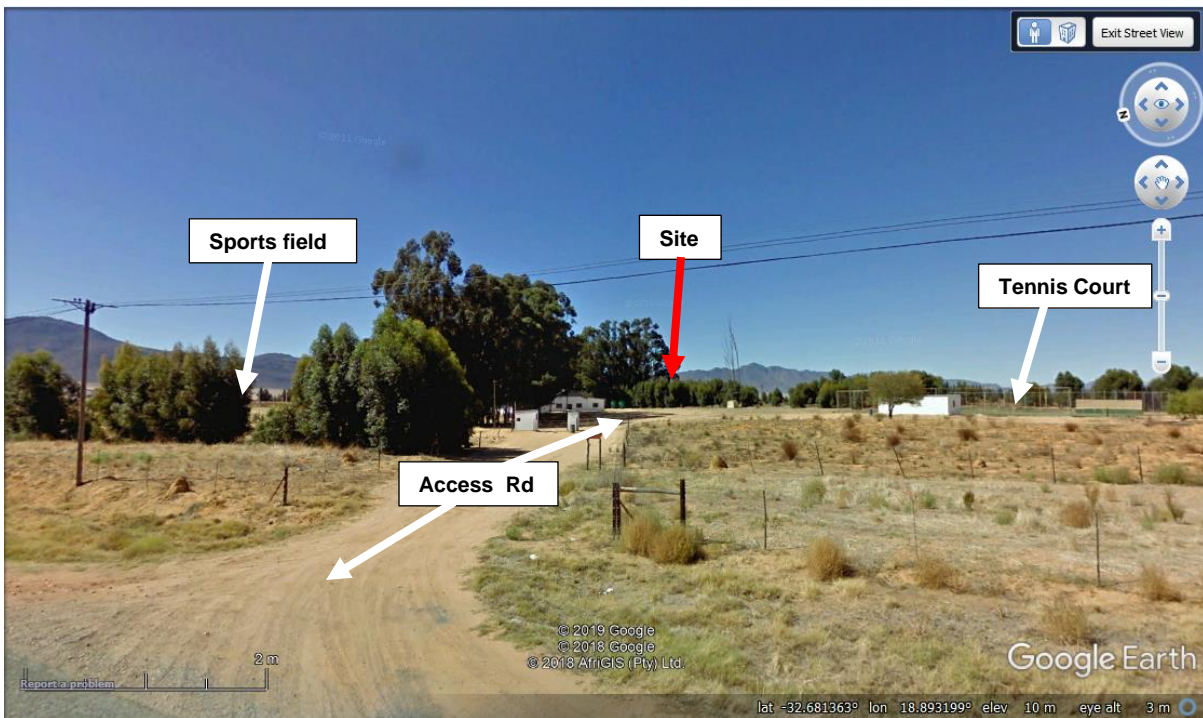
Figure 4: Google Earth view of the proposed site (red arrow) and the access road, looking in a south-eastern direction as viewed from the R365 Road. The sports field is approximately 94m north-west of the site.