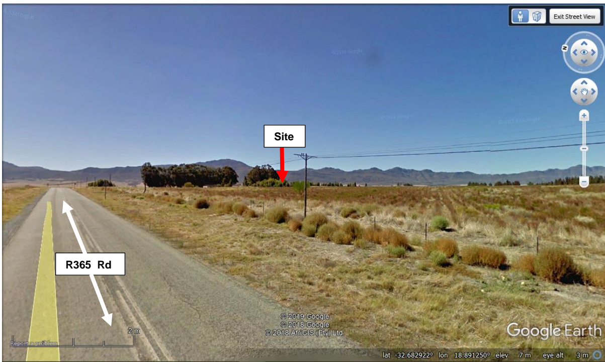
Figure 6: Google Earth view of the proposed site (red arrow), looking in a north-eastern direction as viewed from the R365 Road. The proposed site is surrounded by some mature bluegum trees, which act as some visual screening. The site is generally surrounded by agricultural land uses.