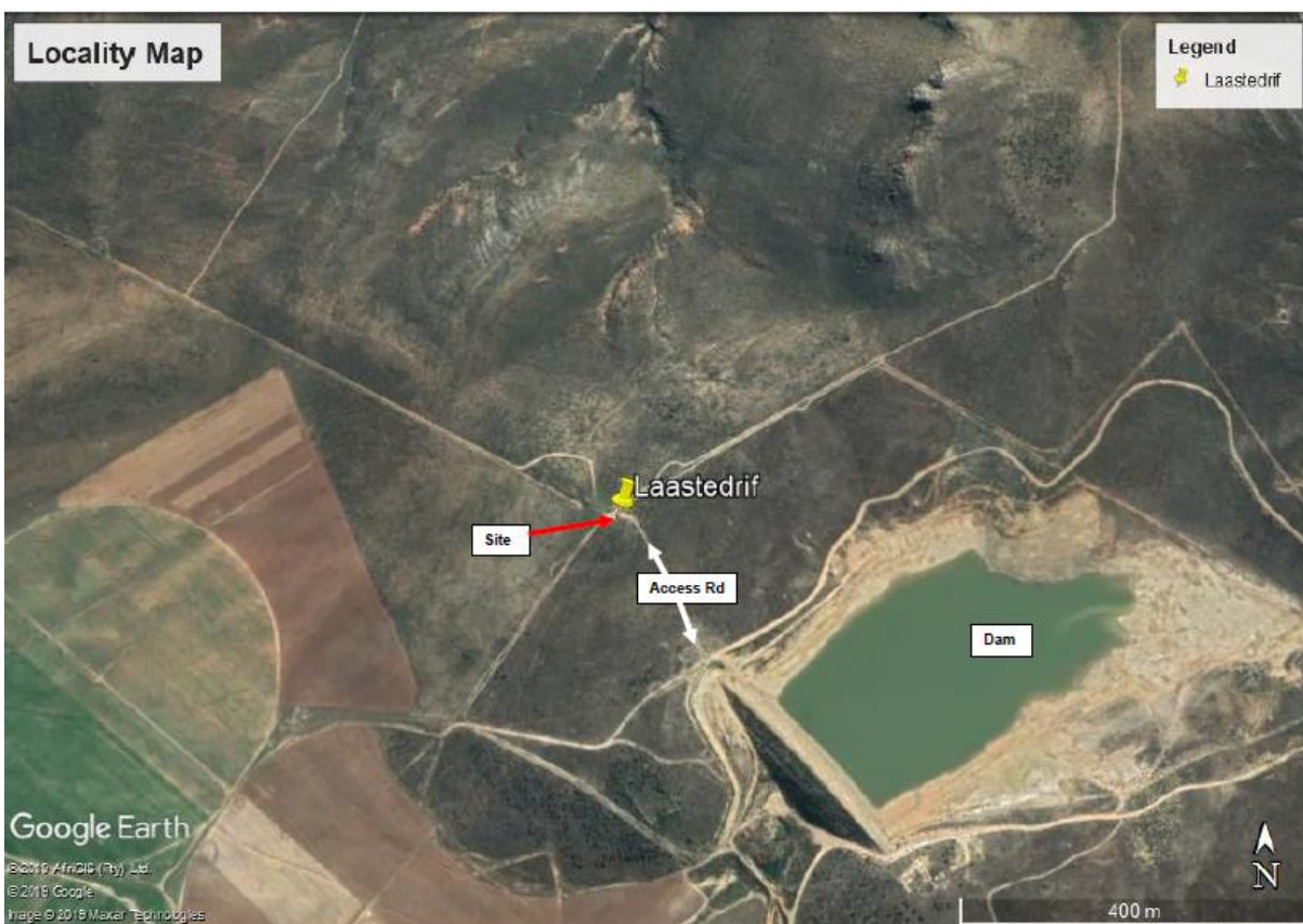
Figure 2: Google Earth aerial view of the site location (yellow placemark). The site is located to the east of Bo-Swaarmoed Road and access to the site will be gained via an existing access road on the property.