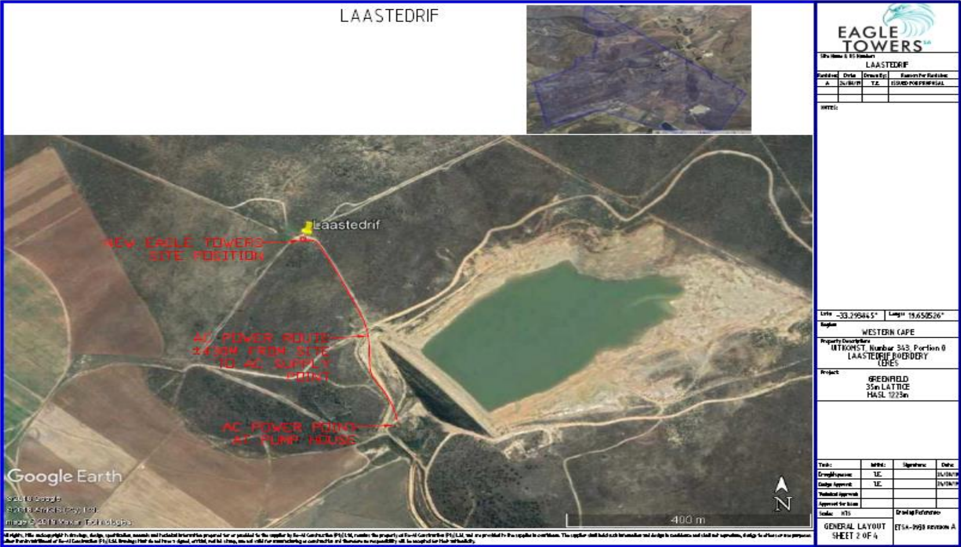
Figure 3. Site plans for the proposed development.