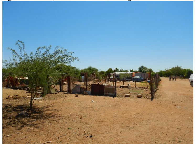
Figure 16: Maildrops done at informal dwellings on site.