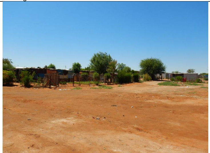
Figure 10: Maildrops done at informal dwellings on site.