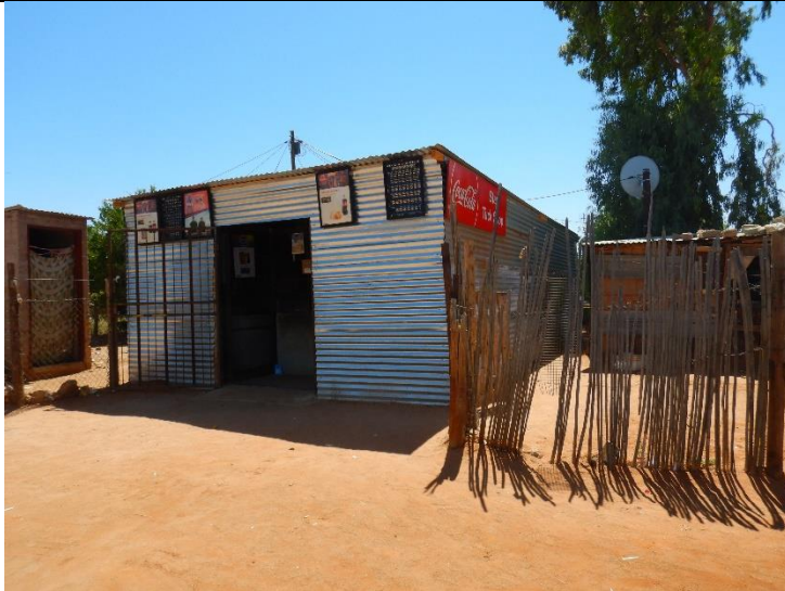
Figure 19: A3 Poster placed against the gate at Star Tuck Shop. Looking in a north-eastern direction.