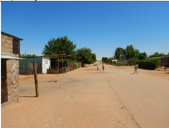
Figure 9: A2 poster placed against the fence at 7de Laan Tuck Shop. Looking in a northern direction.