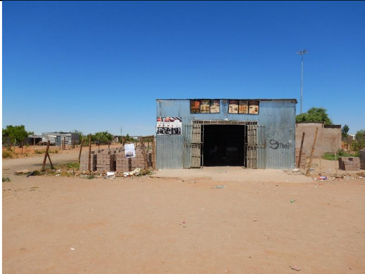
Figure 5: A2 poster placed against the fence at the site, looking in a western direction. A2 poster placed adjacent to a Tuck Shop along Alwyn Street.