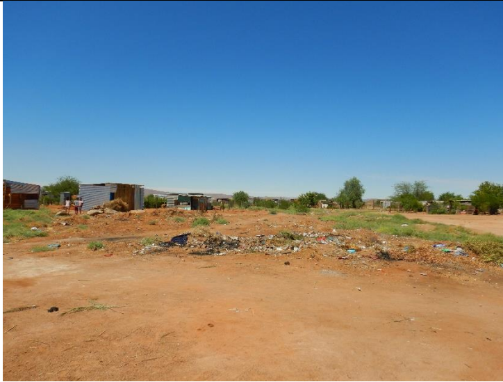
Figure 11: Maildrops done at informal dwellings on site.