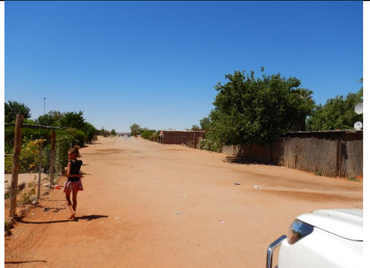
Figure 23: Maildrops done along Alwyn Street, looking in a northern direction.