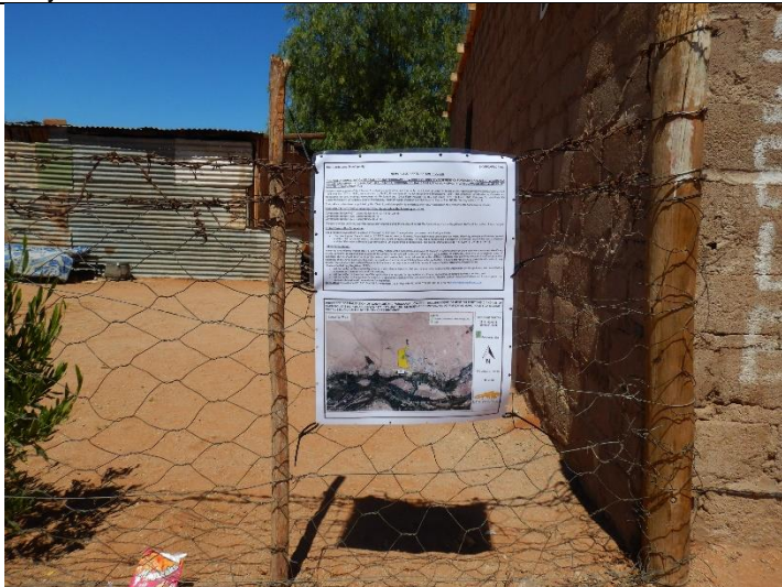
Figure 7: A2 poster placed against the fence at 7de Laan Tuck Shop. Looking in a western direction.