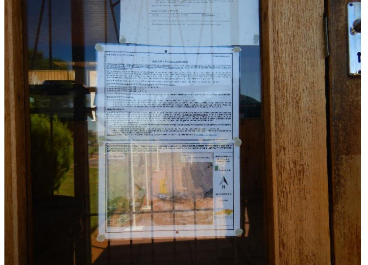
Figure 2: A3 Poster placed against the door at Kai !Garib Municipality in Keimoes.