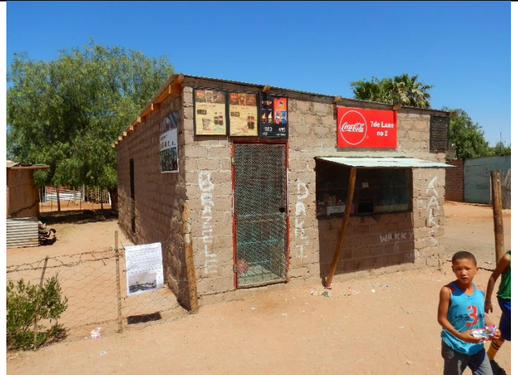
Figure 6: A2 poster placed against the fence at 7de Laan Tuck Shop. Looking in a north-western direction.