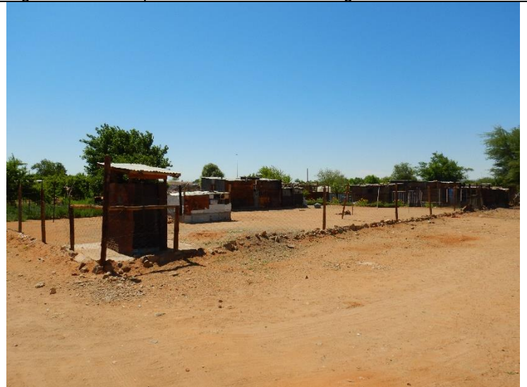
Figure 14: Maildrops done at informal dwellings on site.