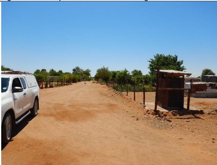
Figure 15: Maildrops done at informal dwellings on site.