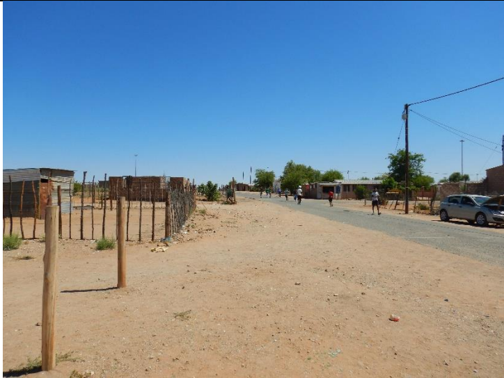
Figure 19: Maildrops done along Alwyn Street, looking in a northern direction. The site is to the left, some informal structures present.