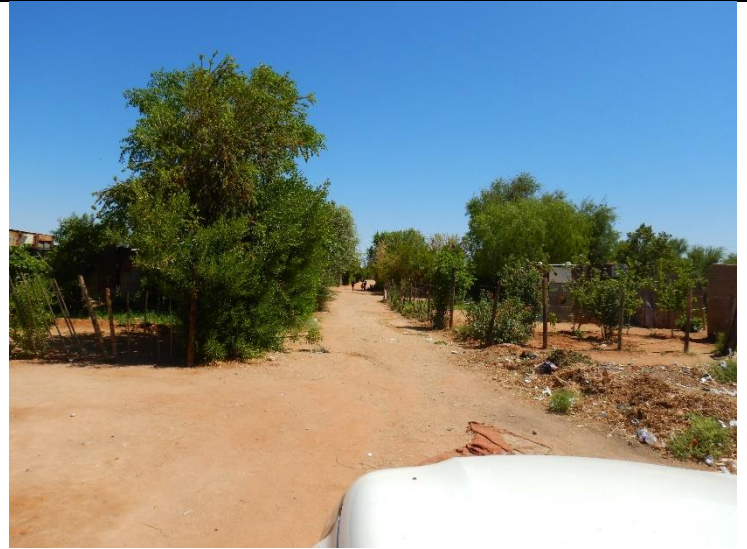
Figure 12: Maildrops done at informal dwellings on site.