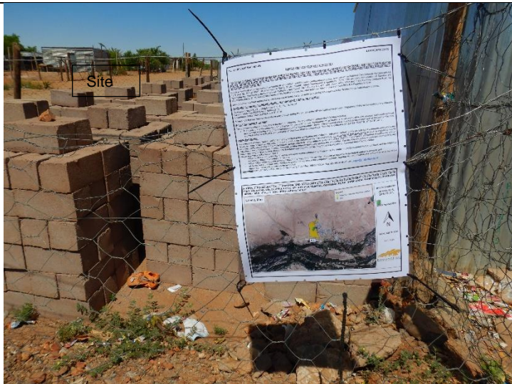
Figure 3: A2 poster placed against fence at the site; looking in a western direction. A2 poster placed adjacent to a Tuck Shop along Alwyn Street.