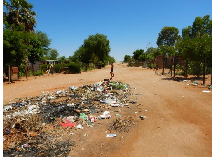
Figure 19: The area to the south of Star Tuck Shop, looking in a northern direction.