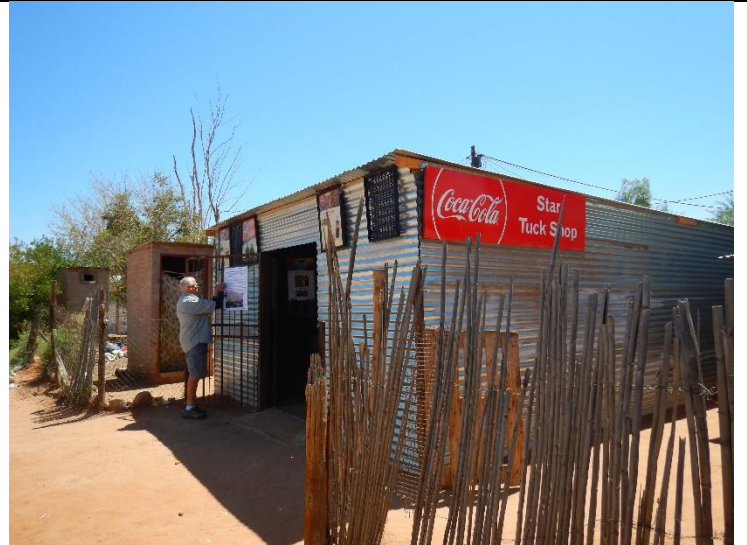
Figure 19: A3 Poster placed against the gate at Star Tuck Shop. Looking in a north-eastern direction.