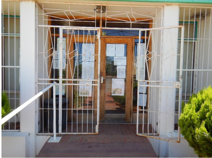
Figure 1: A3 Poster placed against the door at Kai !Garib Municipality in Keimoes.