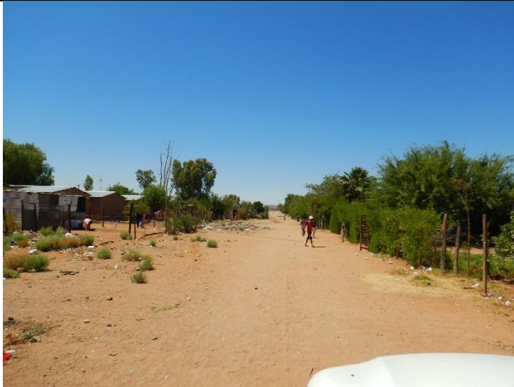
Figure 17: Maildrops done at informal dwellings on site. Looking in a southern direction.