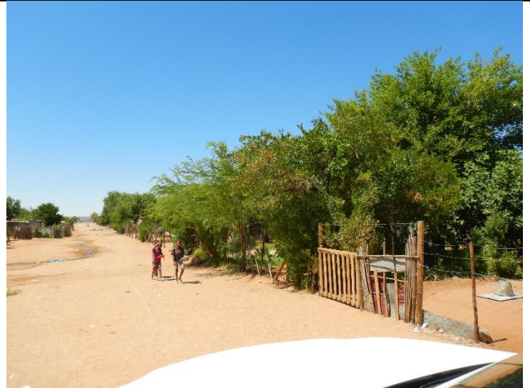
Figure 18: Maildrops done at informal dwellings on site. Looking in a southern direction.