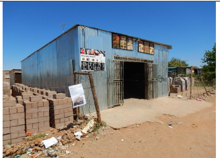
Figure 4: A2 poster placed against fence at the site; looking in a north-western direction. Poster placed adjacent to a Tuck Shop along Alwyn Street.