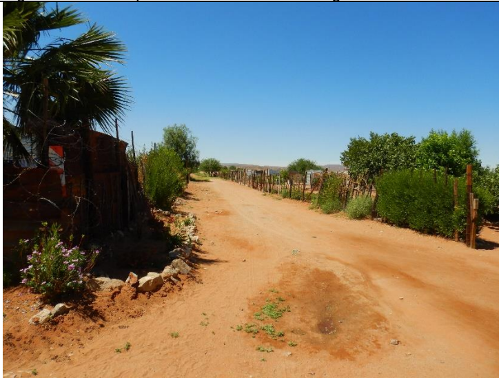
Figure 13: Maildrops done at informal dwellings on site.