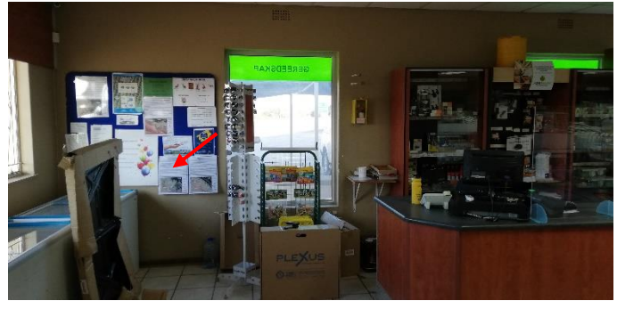
Photo 6: Poster placed at the Aunt Dolletjies Municipal Library in Boegoeberg