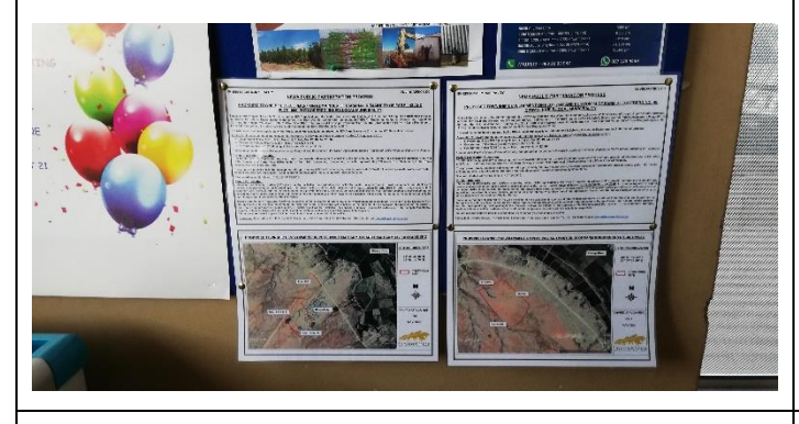
Photo 5: Poster placed at the Aunt Dolletjies Municipal Library in Boegoeberg