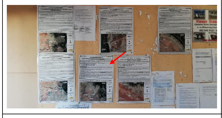
Photo 3: Poster placed at the public notice board at the AgriMark in Groblershoop

Photo 1: Poster placed at the !Kheis Municipal offices in Groblershoop