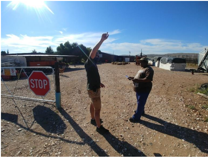
Photo 5: Letter drop-off at landowner/ land occupier adjacent to the proposed site for development.