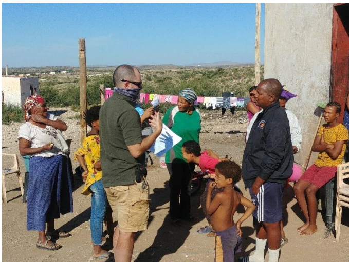
Photo 3: Letter drop-offs at households adjacent to the proposed site for development.