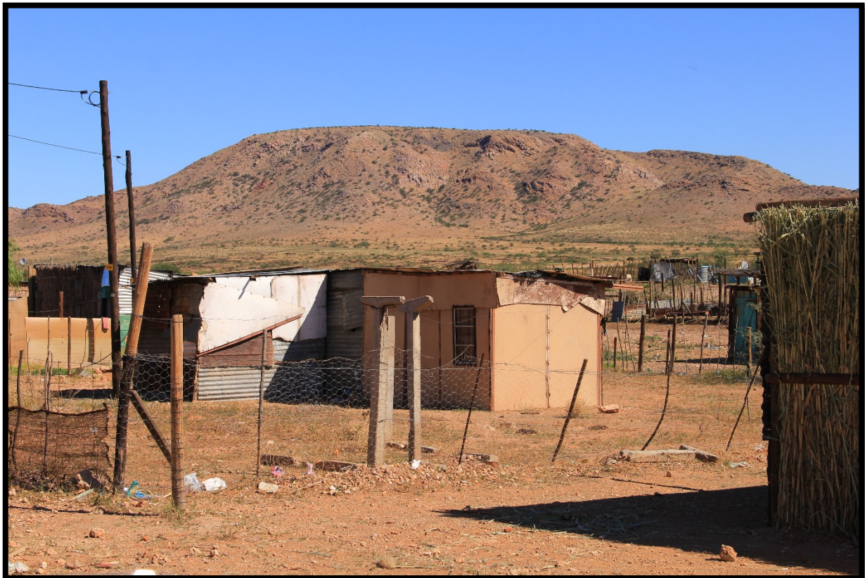
Photo 2: The existing informal houses within the northern segments of the layout, as seen from a westerly direction.