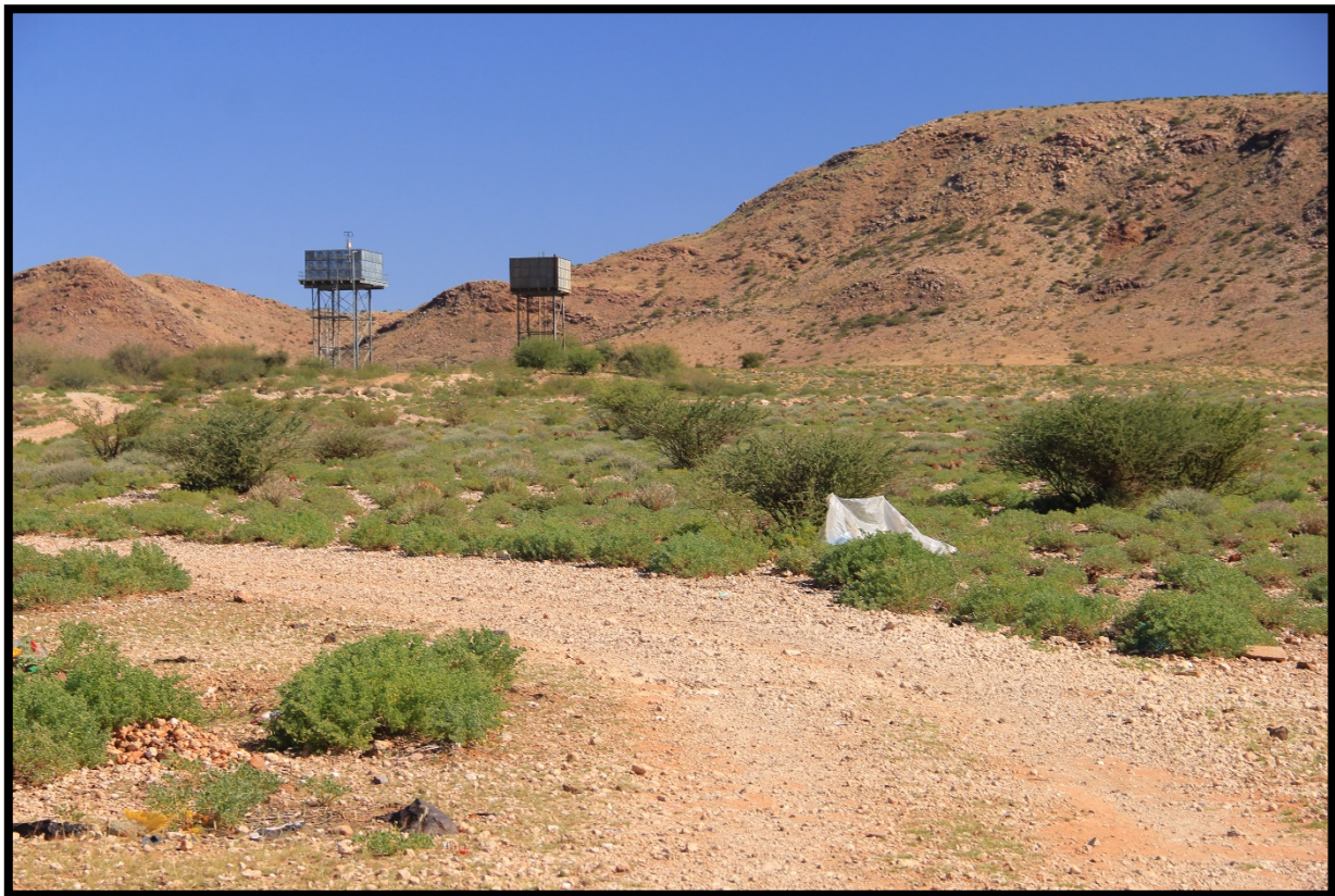
Photo 10: The water infrastructure of the town, Grootdrink, located to the southwest of the study area which also borders the site forming part of the formalisation process.