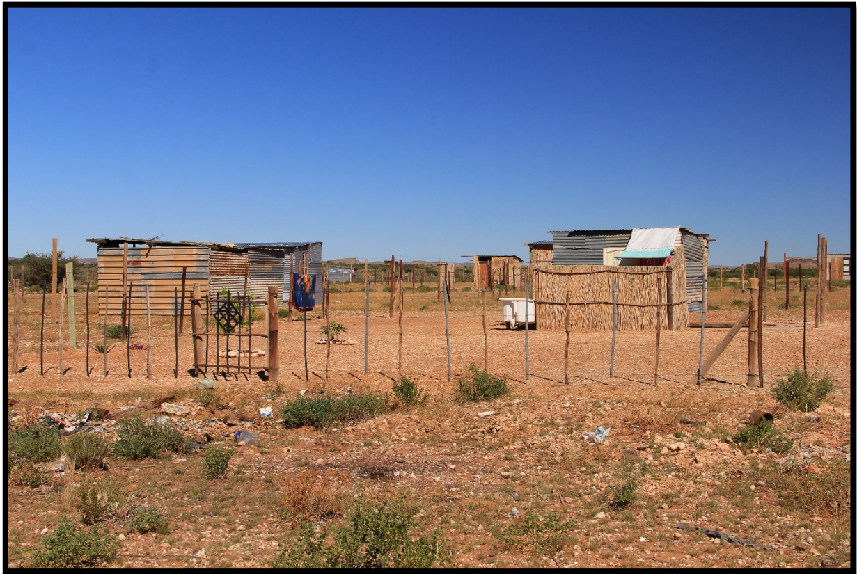
Photo 7: Another photo taken in the southern section of the study area which includes more of the informal houses that are erected in the area, visible in the photo.