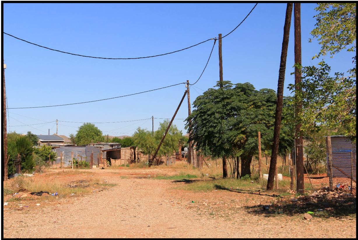
Photo 9: The existing houses and infrastructure of Grootdrink, located adjacent to the study area, as seen from the north.