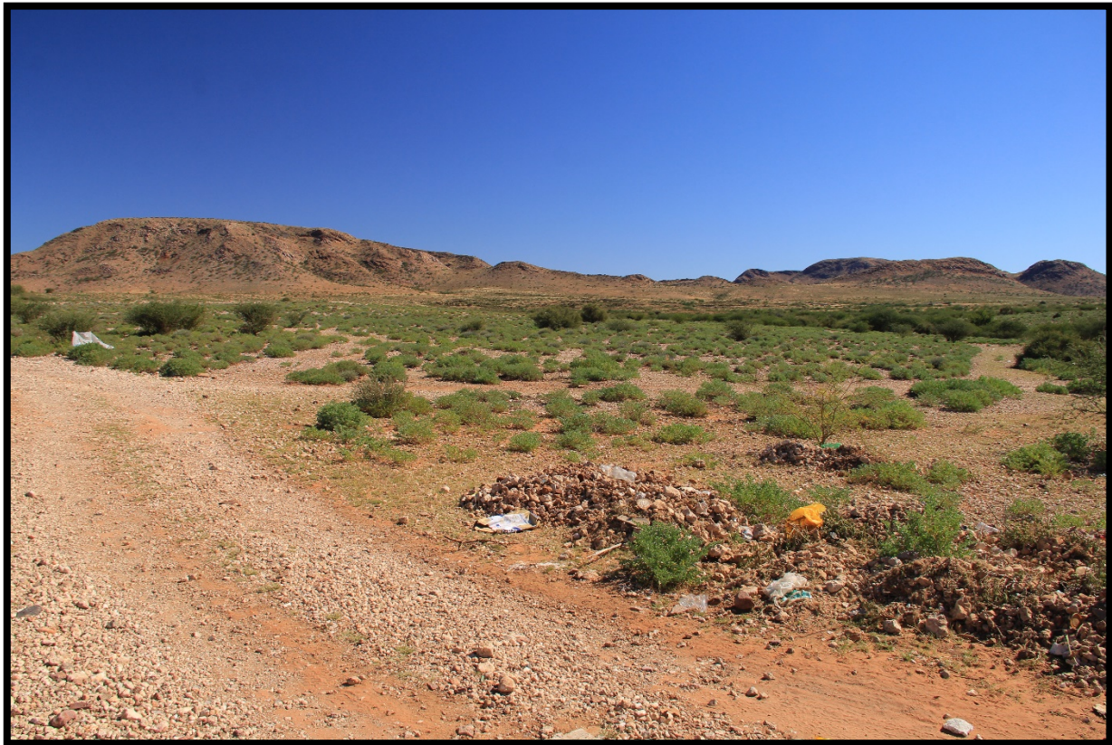
Photo 5: The central parts of the study area as seen from a north-easterly direction.