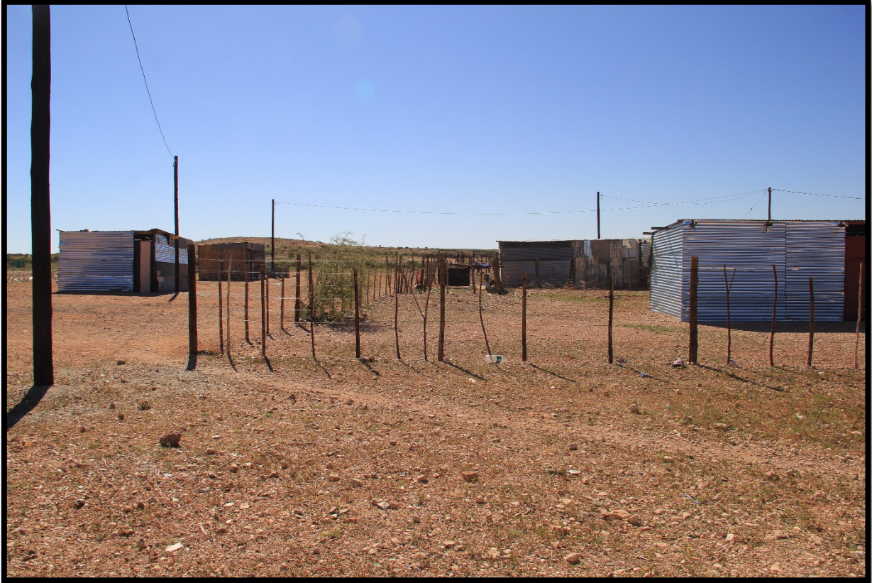
Photo 1: The existing informal houses erected within the northern segments of the study area, as seen from the south. The existing electrical infrastructure already erected in the community is also visible in the photo.