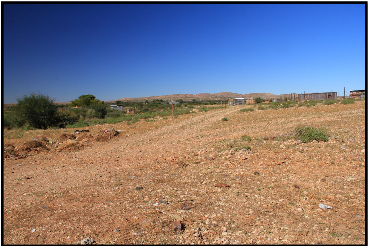
Photo 8: The south-easterly section of the study area, as seen from the west. The informal structures located within the area are visible on the left-hand side of the photo.