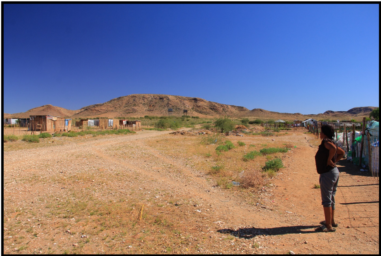
Photo 6: The informal houses that are located within the southern sections of the study area, as seen from the northeast.