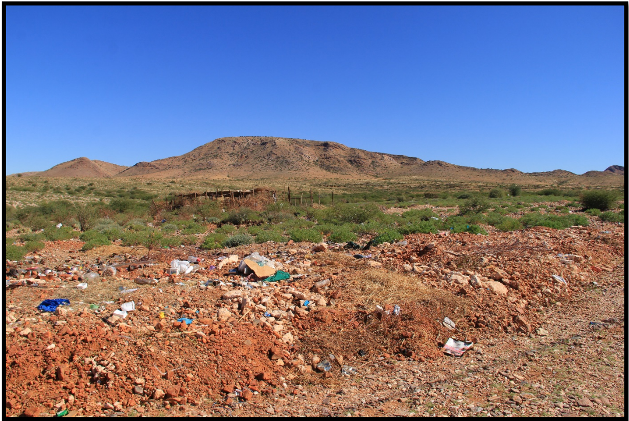
Photo 3: The vacant land to the west of the town that will form part of the residential expansion of the town, as seen from a westerly direction.