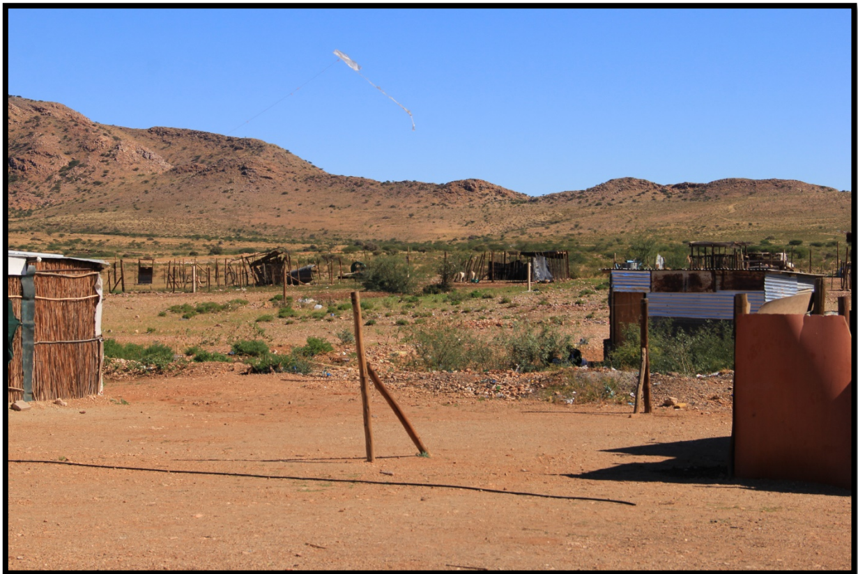
Photo 4: The central to northern sections of the study area as seen from a westerly direction. The existing informal houses that can be found on the property is visible in the photo.