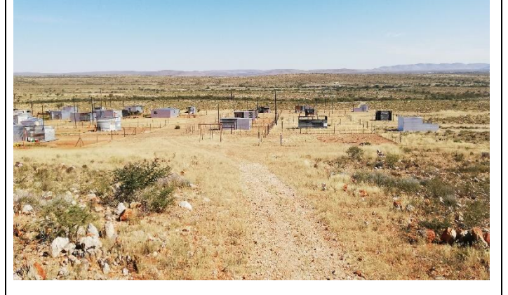
Photo 3: Taken from point 1, facing south-east towards existing households within the proposed site for development.

Photo 2: Taken from point 1, looking easterly direction over existing households within the proposed Opwag site earmarked for development.