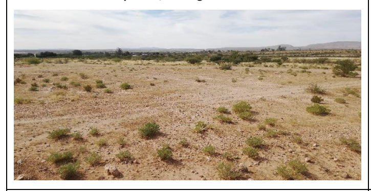
Photo 3: Taken from point 2, looking at the old wastewater treatment works