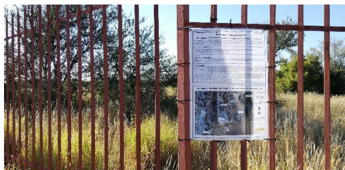
Photo 1: Poster on the western corner of the site, cnr of Seodin Rd and Cunningham Ave