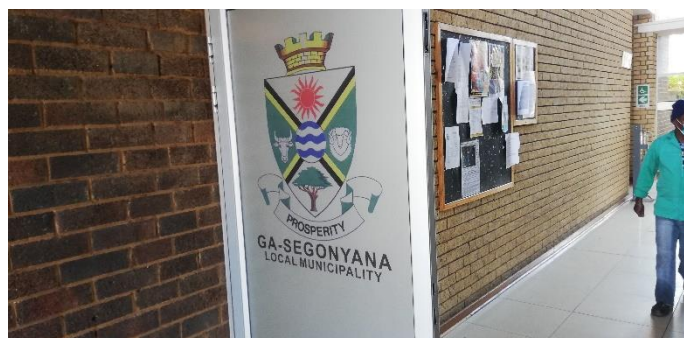
Photo 5: Poster at the Ga-Segonyana Local Municipality offices, Skool Str, Kuruman