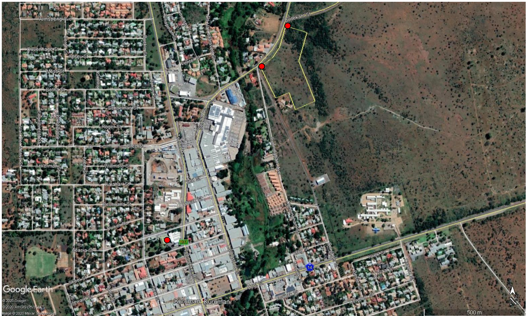
Location of posters indicated by the red dots