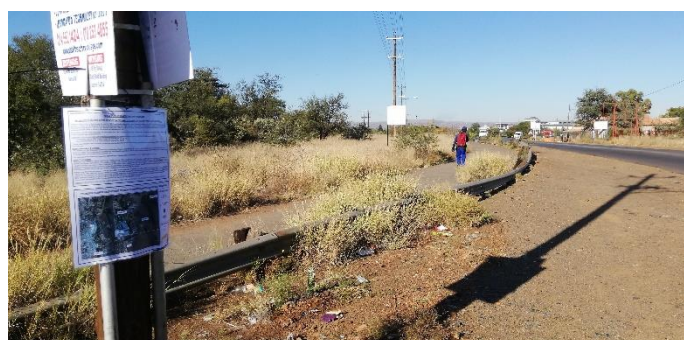
Photo 3: Poster on the northern corner of the site, cnr of Seodin Rd and Buitenkant Str.