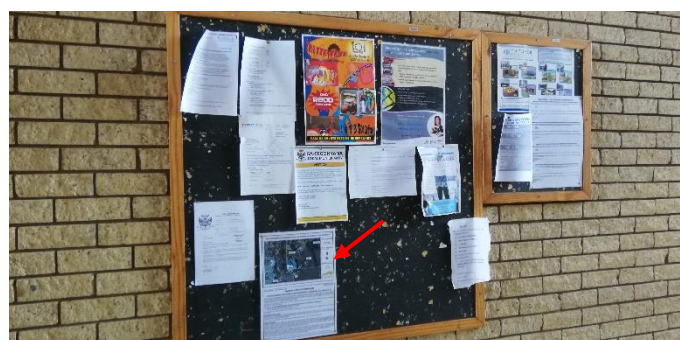
Photo 4: Poster at the Ga-Segonyana Local Municipality offices, Skool Str, Kuruman