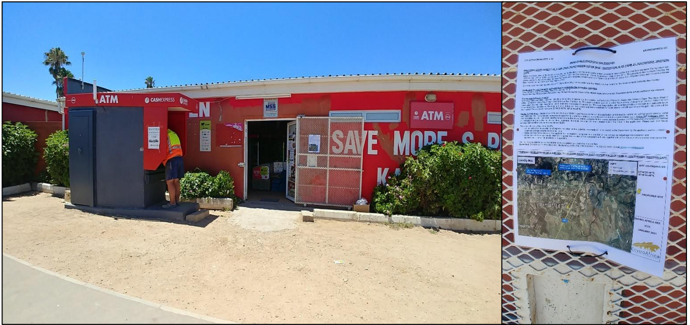
Figure 15. Placement of Poster (A3) at the entrance to the Save More Superette located on Old Malmesbury Road at the following location: 33°34'24.93"S; 18°38'49.49"E. Inset shows a close-up of the poster placed at the entrance of the shop. This shop was chosen due to the amount of foot traffic entering and exiting the shop (i.e. poster was placed in a conspicuous place for all shoppers to see on their way in and out of the shop).