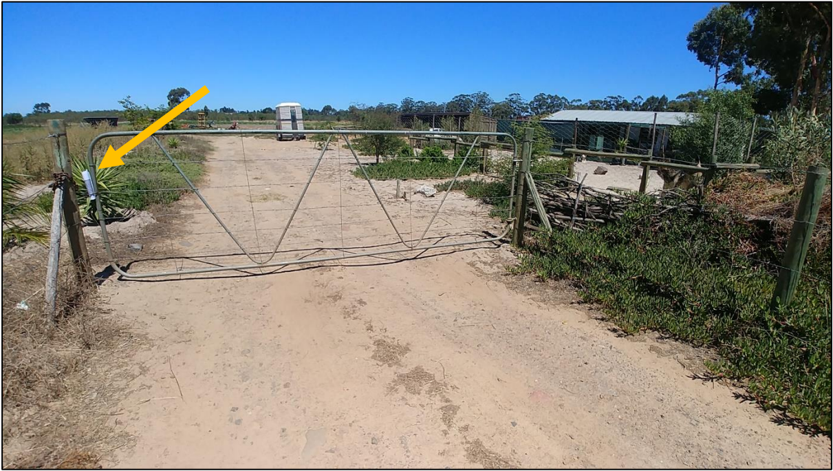
Figure 7. Placement of notification letter in gate of property along Rondeberg Road.