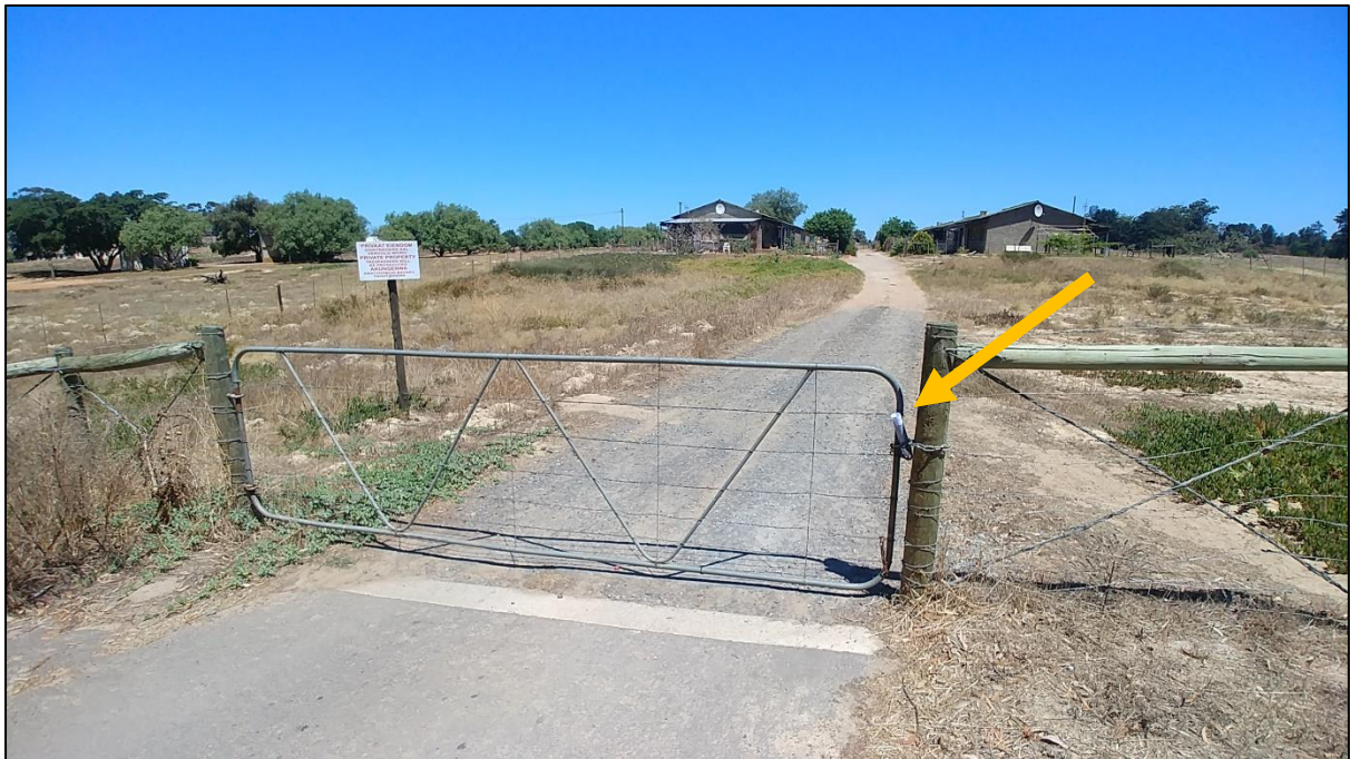
Figure 6. Placement of notification letter in gate of property along Rondeberg Road.