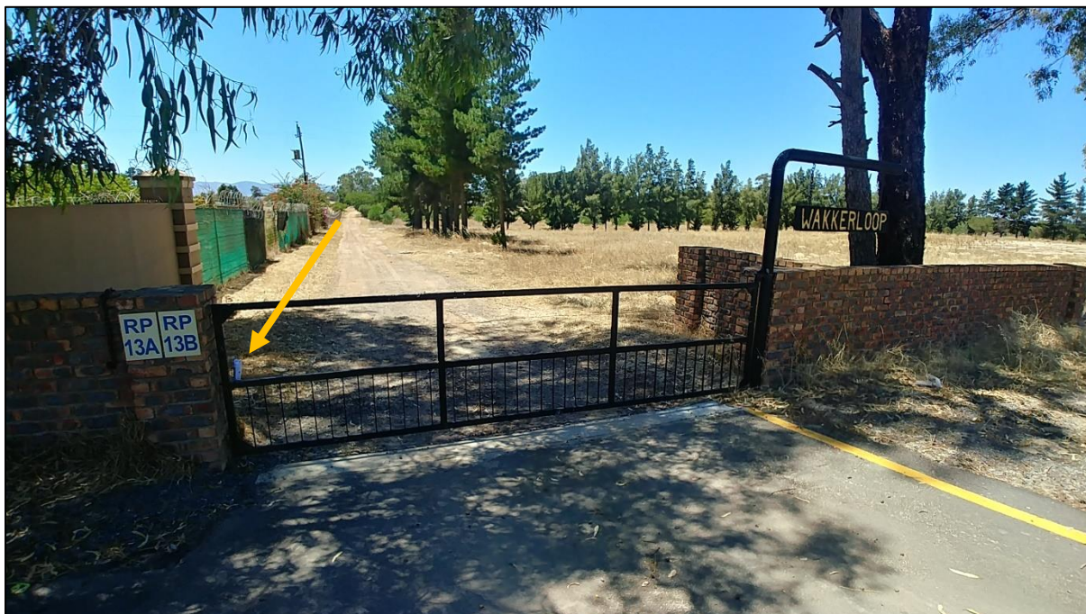
Figure 11. Placement of notification letter in gate of property along Rondeberg Road.