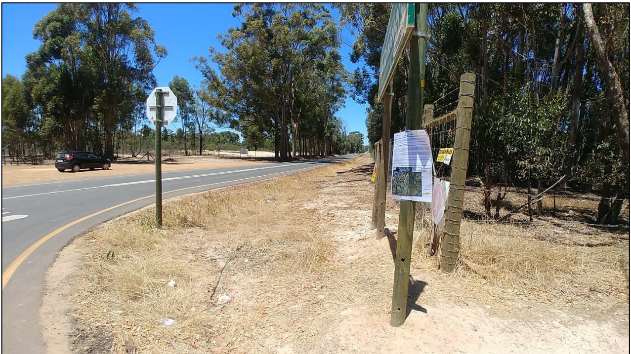
Figure 14. Placement of Poster (A2) at the corner of Klein Dassenberg Road and Rondeberg Road at the following location: 33^{\circ}34'56.4''\text{S } 18^{\circ}35'42.2''\text{E} . View in a southerly direction along Rondeberg Road.