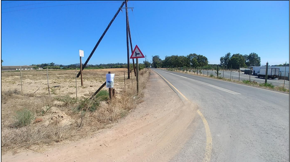
Figure 1. Placement of poster (A2) in a conspicuous place on property fence ( 33^{\circ}36'23.3''\text{S} 18^{\circ}35'34.6''\text{E} ), approximately 20m away from the proposed site for development. View facing a northerly direction.