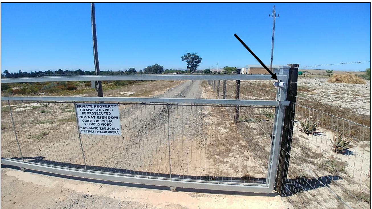
Figure 4. Placement of notification letter in gate of neighbouring property.