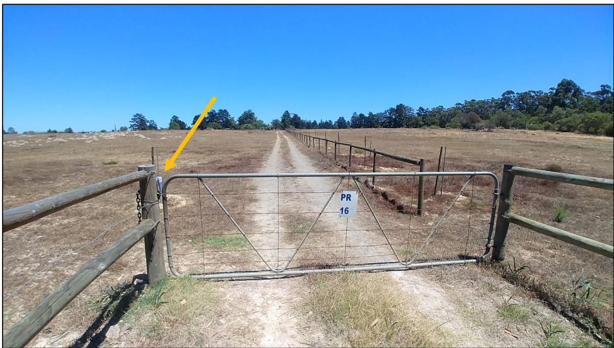
Figure 10. Placement of notification letter in gate of property along Rondeberg Road.