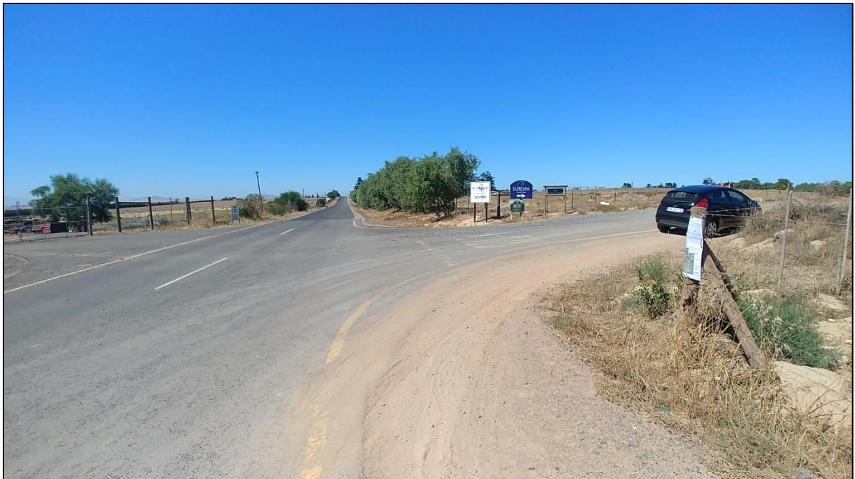
Figure 2. Placement of poster on property fence ( 33^{\circ}36'23.3''\text{S} 18^{\circ}35'34.6''\text{E} ), approximately 20m away from the proposed facing southerly direction.