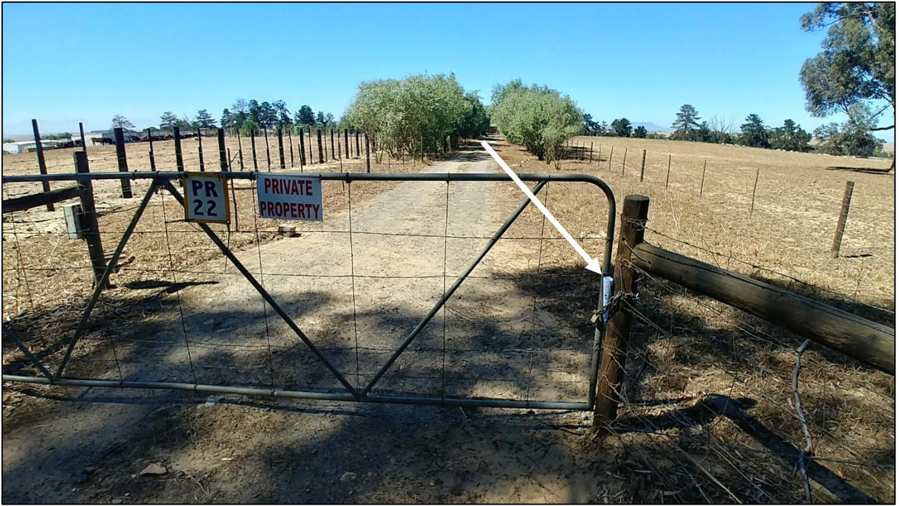
Figure 3. Placement of notification letter in gate of neighbouring property.