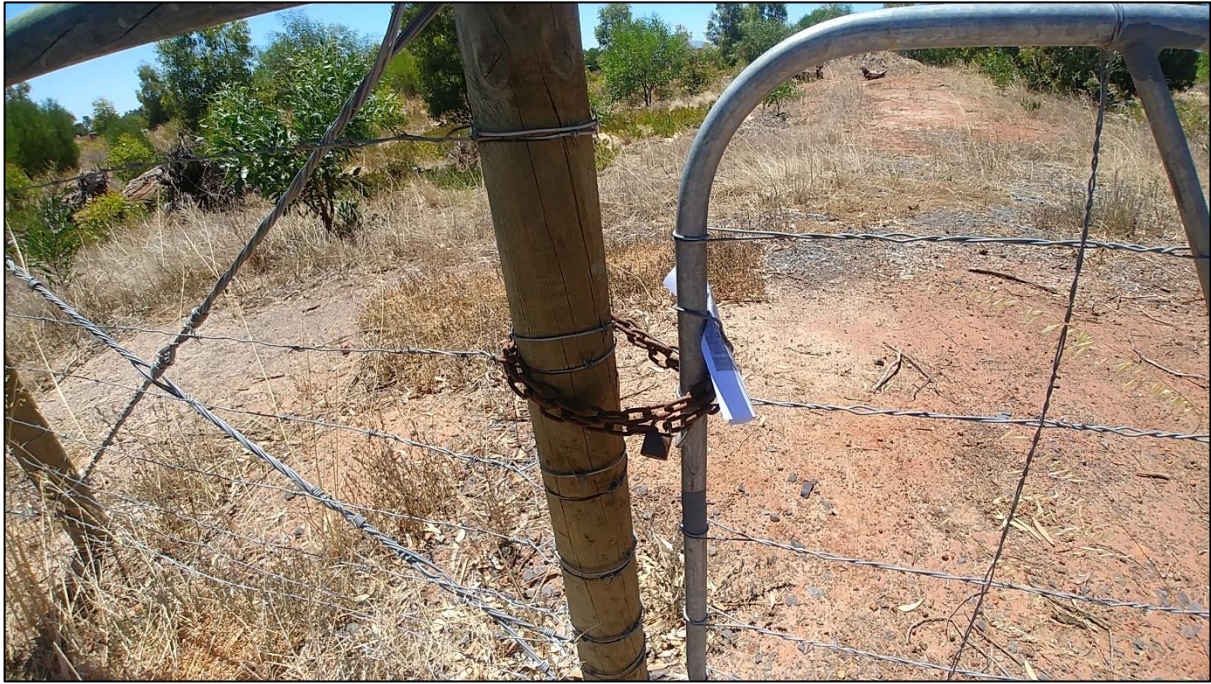
Figure 5. Placement of notification letter in gate of neighbouring property. Vacant property which was locked at time of the site visit.