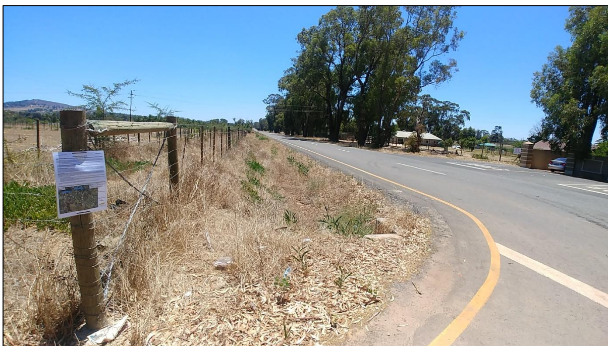
Figure 12. Placement of Poster (A3) at the corner of Rondeberg Road and Stilwater Road at the following location: 33°35'50.7"S 18°35'37.3"E .