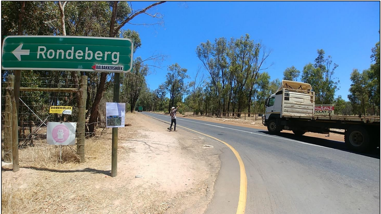
Figure 13. Placement of Poster (A2) at the corner of Klein Dassenberg Road and Rondeberg Road at the following location: 33^{\circ}34'56.4''\text{S } 18^{\circ}35'42.2''\text{E} . View in a westerly direction along Klein Dassenberg Road.