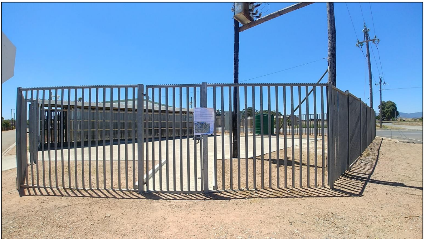
Figure 16. Placement of Poster (A2) at the entrance to the clinic in Kalbaskraal (the closest town to the proposed site for development) at the following location: 33°34'31.13"S; 18°38'47.78"E.