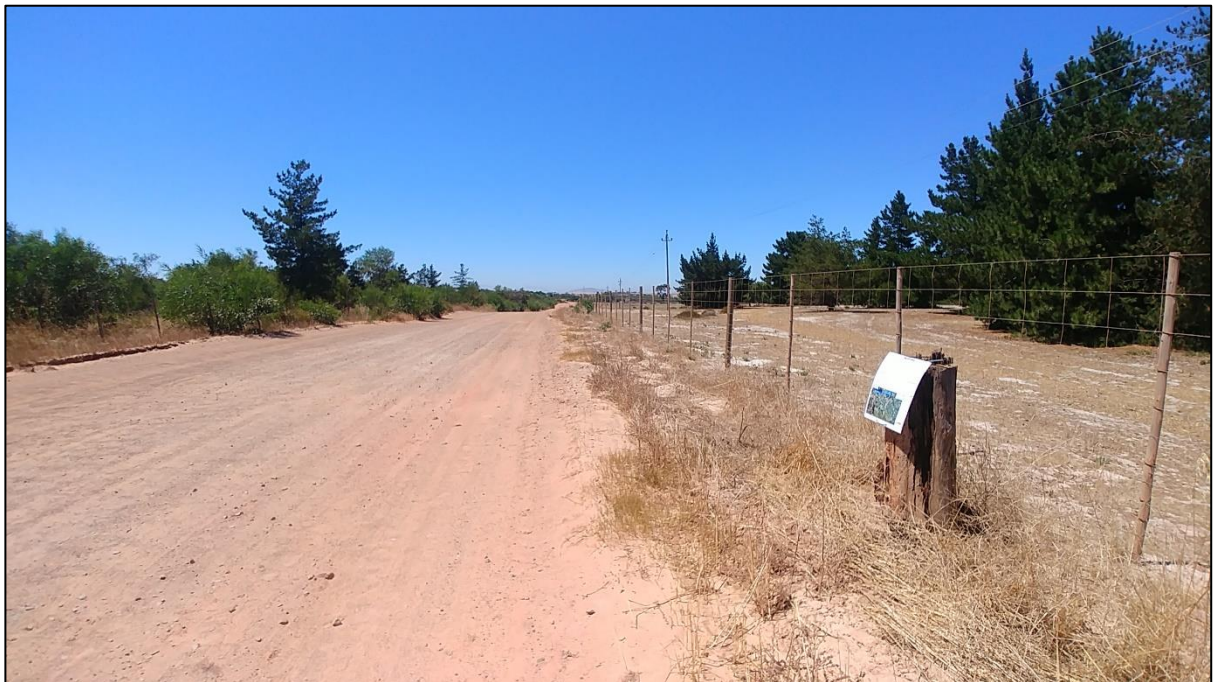
Figure 8. Placement of Poster (A3) at the following location: 33^{\circ}36'08.2''\text{S } 18^{\circ}34'34.2''\text{E} .