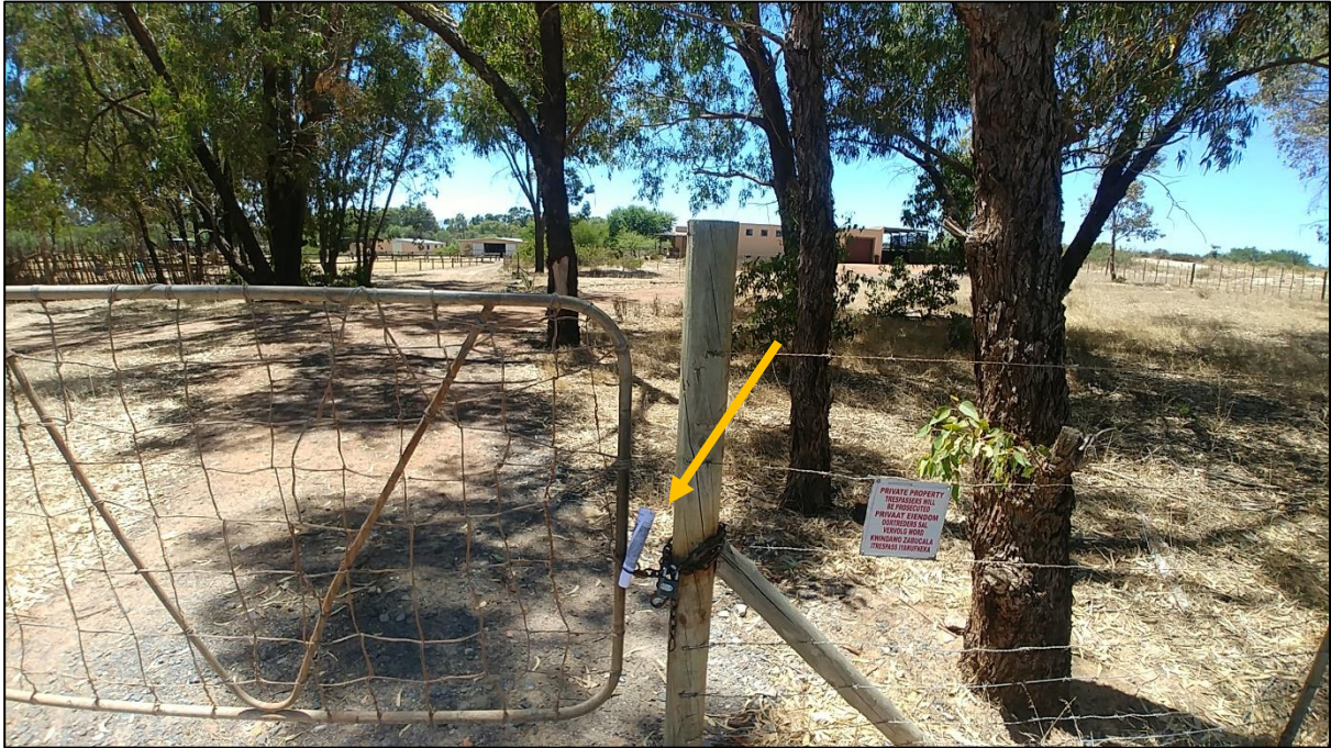
Figure 9. Placement of notification letter in gate of property along Rondeberg Road.