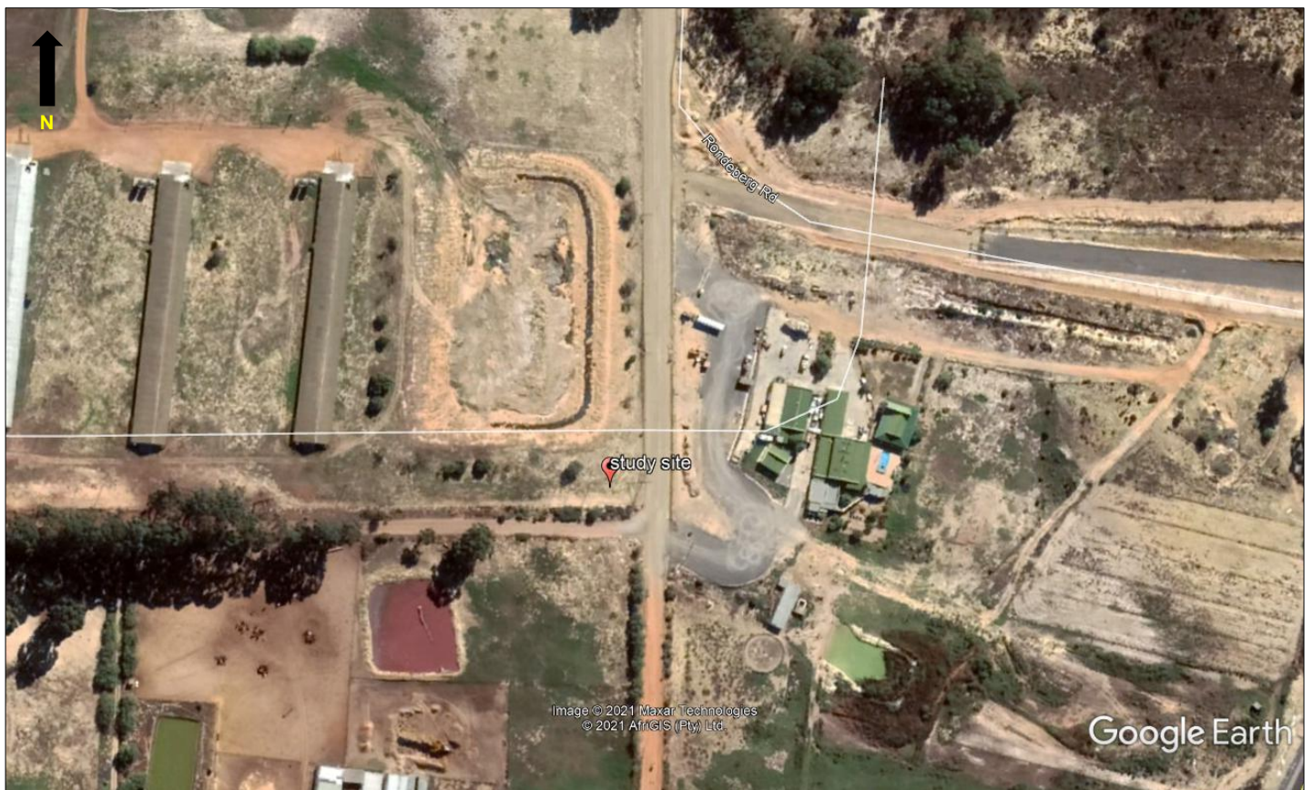
Figure 4. Close up Google Earth satellite map indicating the location of the study site alongside Rondeberg Road