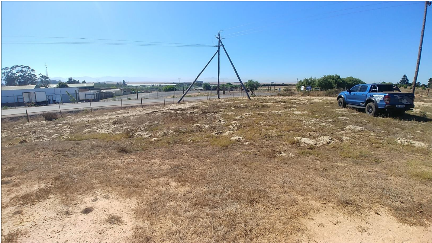
Figure 6 The site alongside Rondeberg Road. View facing south