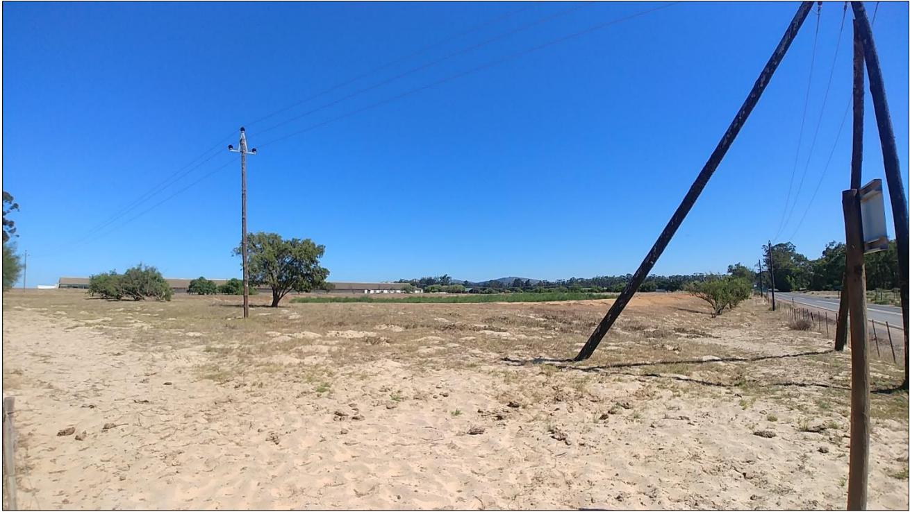
Figure 7. View of the study site facing north alongside Rondeberg Road