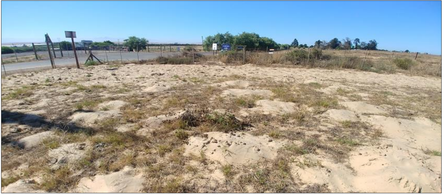
Figure 5. View of the study site facing south alongside Rondeberg Road