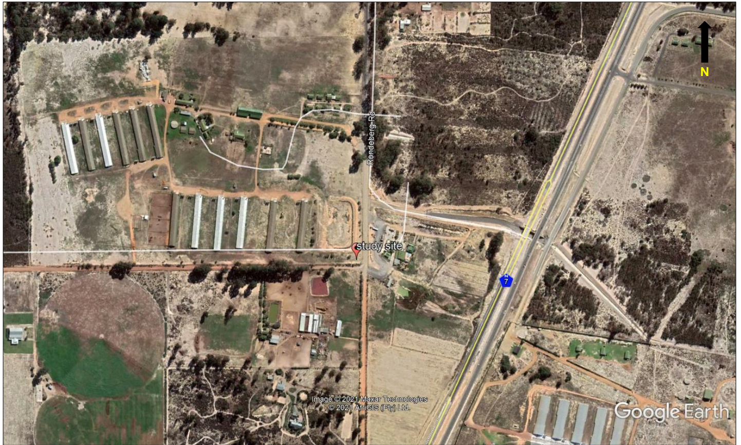
Figure 3. Google Earth satellite map indicating the location of the study site and the surrounding land use