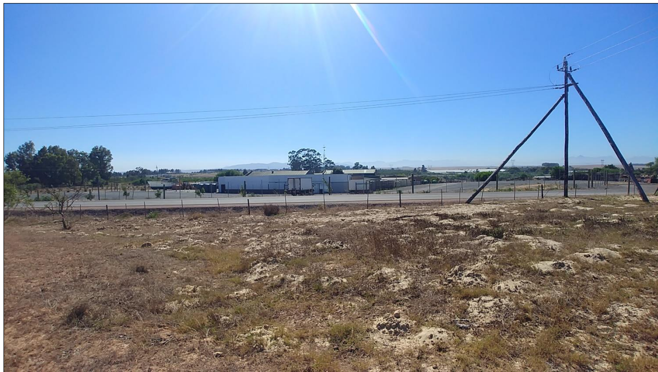
Figure 8. View of the study site with Rondeberg Road in the background of the plate