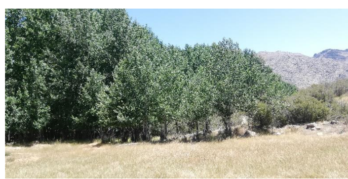
Photo 10: Taken from point 3, looking north-west towards the dam wall site

Photo 9: Taken from point 3, looking west towards the dam wall site