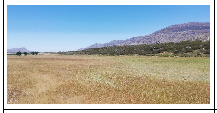
Photo 11: Taken from point 4, looking north over the proposed dam site