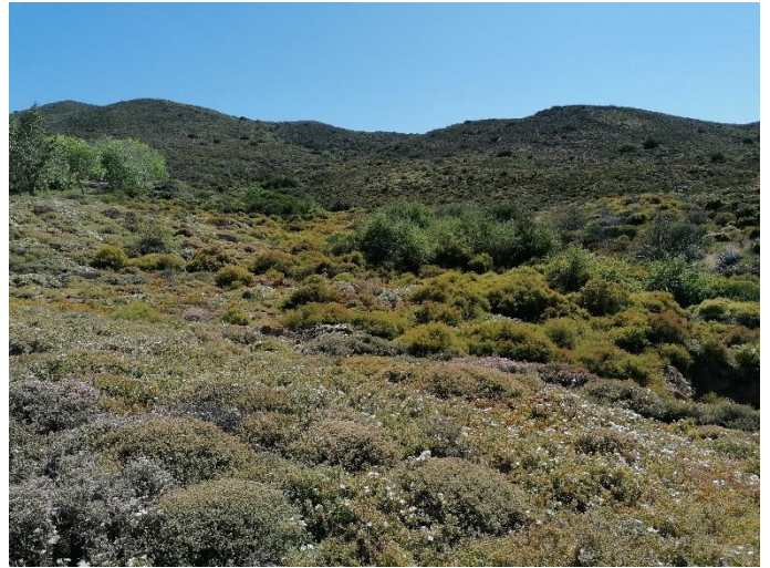
Photo 6: Taken from point 2, looking north-west over the proposed dam site.