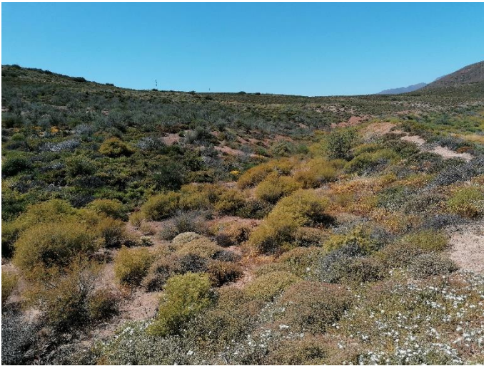
Photo 18: Taken from point 4, looking south-east along the bypass channel/cut-off trench