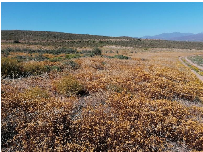
Photo 15: Taken from point 3, looking south over the proposed agricultural site.