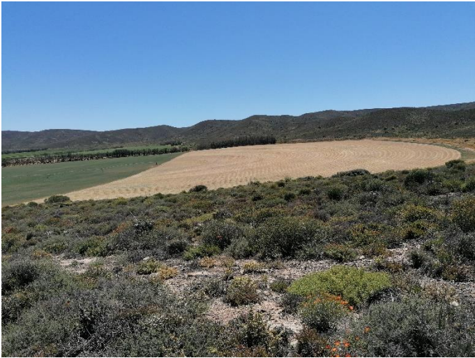
Photo 19: Taken from point 5, looking north over the proposed agricultural site.