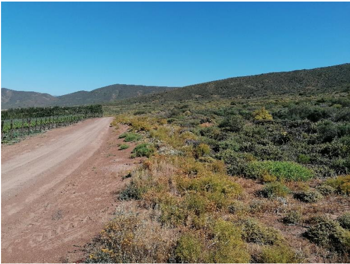
Photo 1: Taken from point 1, looking west from the existing farm road. To the left of the image are the existing vineyards, and to the right is the proposed area for expansion of crops.