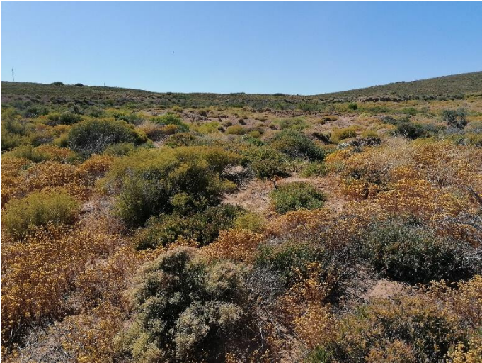
Photo 13: Taken from point 3, looking east over the proposed agricultural site.