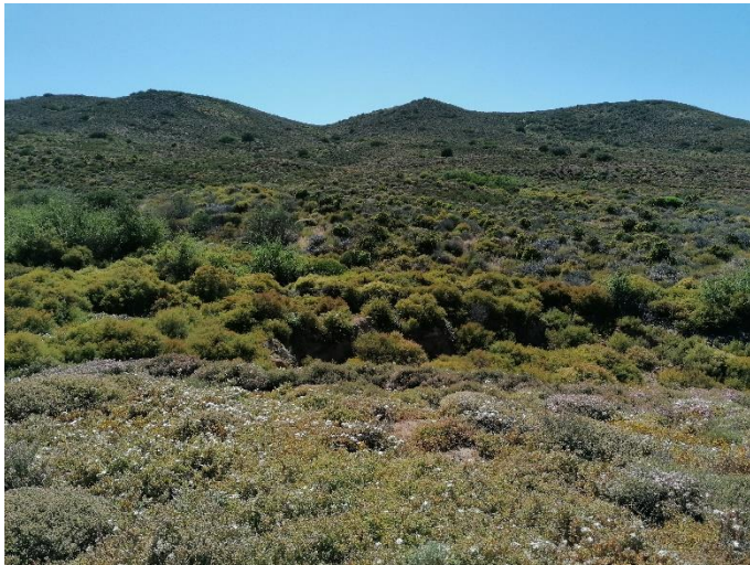
Photo 7: Taken from point 2, looking west over the proposed dam site.