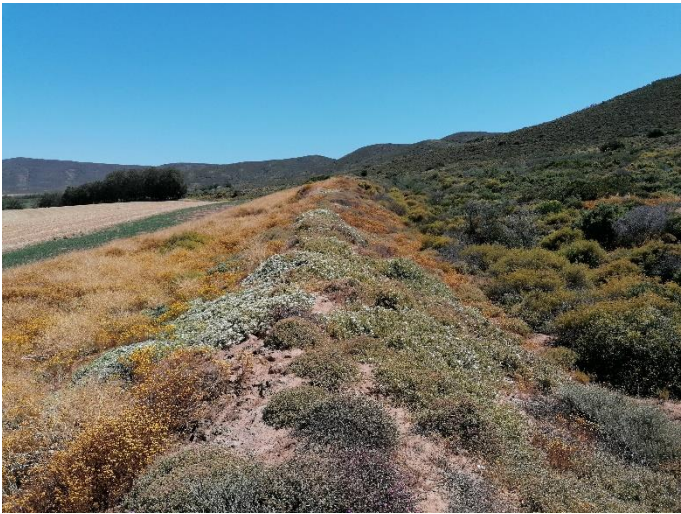
Photo 17: Taken from point 4, looking north-west along the bypass channel/cut-off trench