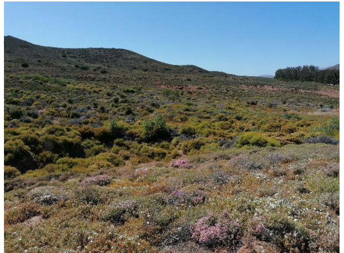
Photo 8: Taken from point 2, looking south-west over the proposed dam site.