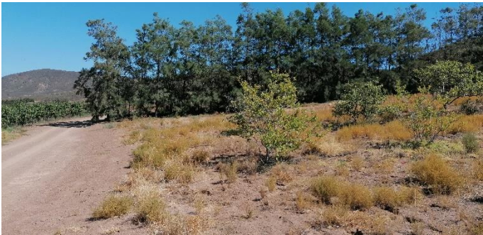
Photo 21: Taken from point 6, looking north-west over the proposed site of the additional storage tanks.