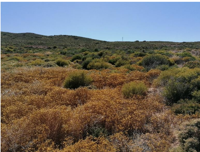
Photo 12: Taken from point 3, looking north-east over the proposed agricultural site.