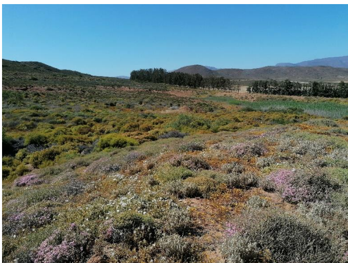
Photo 9: Taken from point 2, looking south south-west over the proposed dam site. The existing dam can be seen in this image.