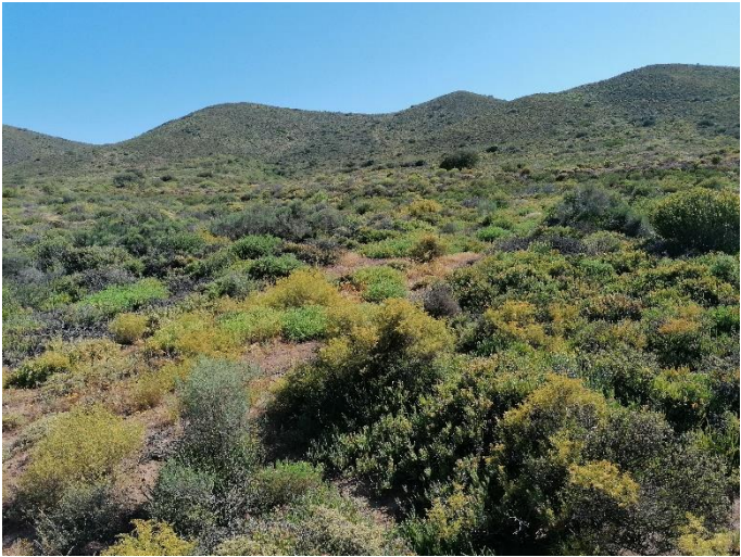
Photo 2: Taken from point 1, looking north-west over the proposed site.