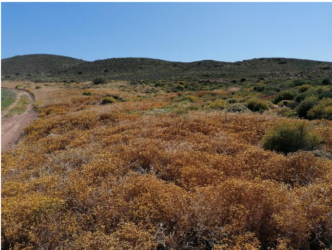
Photo 11: Taken from point 3, looking north over the proposed agricultural site. The existing centre-pivot irrigated land can be seen to the left of the road.