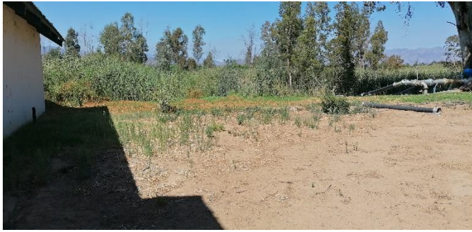
Photo 23: Taken from point 7, looking south-west at the existing pump-station on the banks of the Bree River