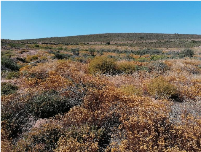
Photo 14: Taken from point 3, looking south-east over the proposed agricultural site.