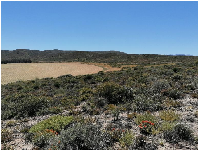
Photo 20: Taken from point 5, looking north-east over the proposed agricultural site.