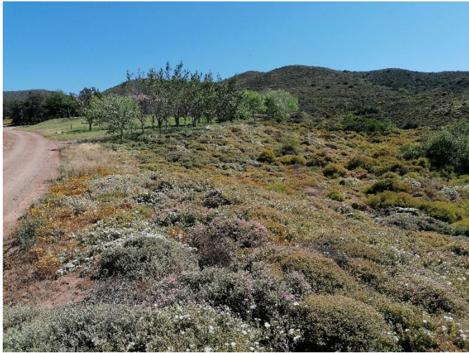
Photo 5: Taken from point 2, looking north over the proposed dam site.