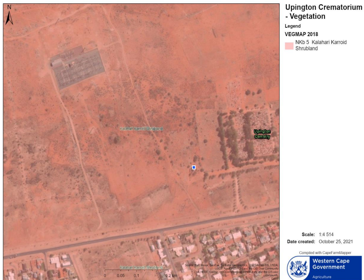
Figure 3. Vegetation type, namely Kalahari Karroid Shrubland

The Botanical Assessment findings will be discussed in detail in the Draft Basic Assessment Report