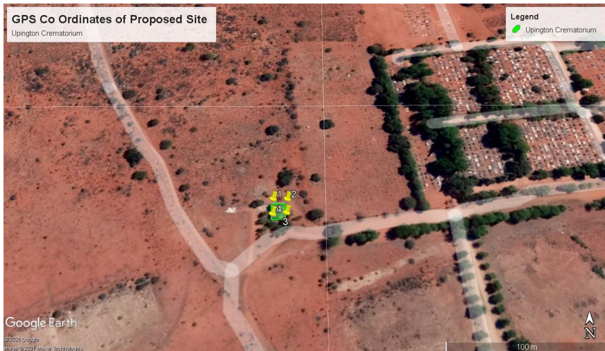
Figure 1. Proposed expansion of the Upington Crematorium, located on Erf 16450, Upington (at the following co-ordinates: 28°26'1.21"S; 21°17'50.03"E)