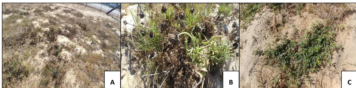
Figure 4. Plant species [A = Fynkweek ( Cynadon dactylon ); B = Cephalophyllum spp; C = common duwweltjie ( Tribulus sp.)] present within the construction footprint. Note, these plant species are indicators of disturbed areas and are not of conservational significance.

According to the 2018 (beta 2) update of the Vegetation map of SA (Mucina & Rutherford, 2006) the proposed site for development is located within the Atlantis Sandstone Fynbos vegetation type, classified as Endangered (EN) in terms of the “ List of ecosystems that are threatened and in need of protection ” (GN 1002, December 2011), promulgated in terms of the National Environmental Management Biodiversity Act, Act 10 of 2004. The proposed development footprint is approximately 90m 2 and will thus, not exceed 100m 2 . No plant species of conservational value are present within the proposed development footprint. Plant species present within the construction footprint is limited to disturbance indicators (namely common duwweltjie ( Tribulus sp.), Fynkweek ( Cynadon dactylon ), and Cephalophyllum spp. (possibly Cephalophyllum loreum ) (Figure 4). From the Biodiversity Overlay Maps from Cape Farm Mapper, the site does not fall within a Critical Biodiversity Area (CBA) or Ecological Support Area (ESA).