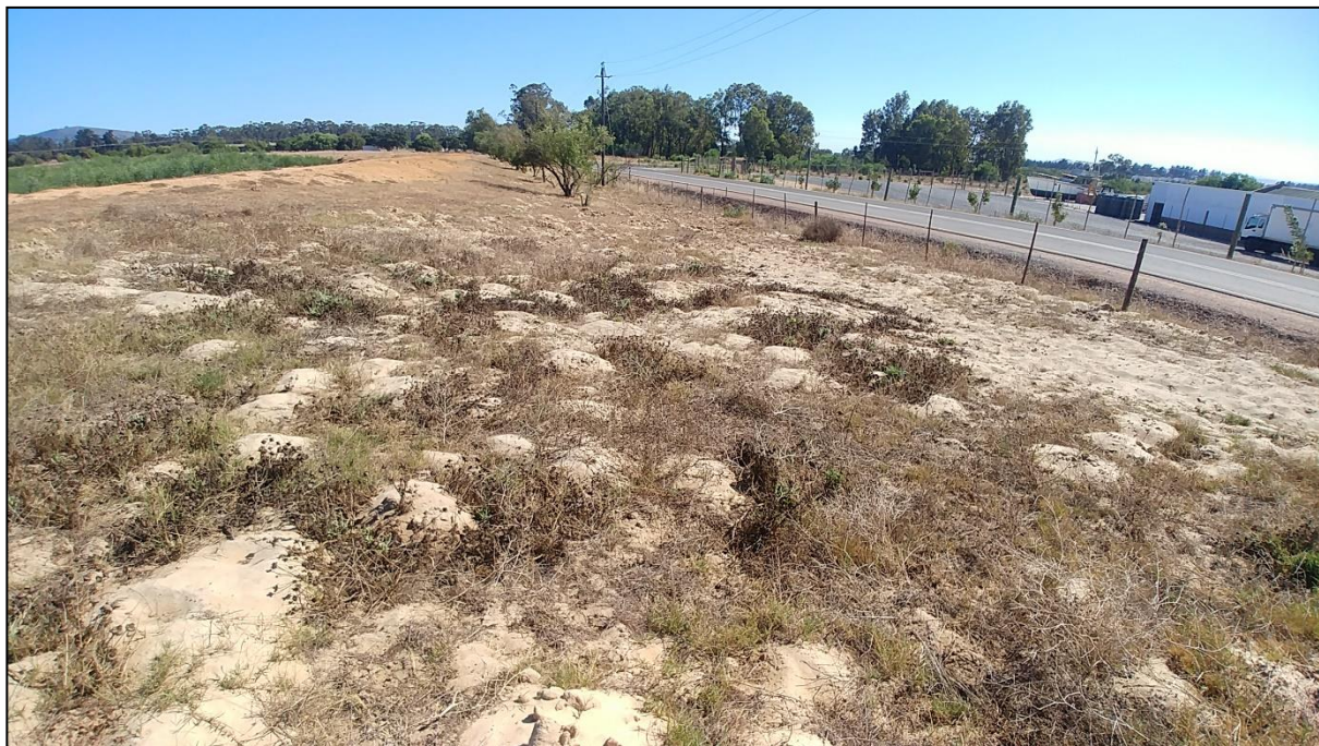
Figure 3. Disturbed vegetation associated with the proposed site for development. Vegetation includes common duwweltjie ( Tribulus sp.), Fynkweek ( Cynodon dactylon ), and potentially Arctotis sp.