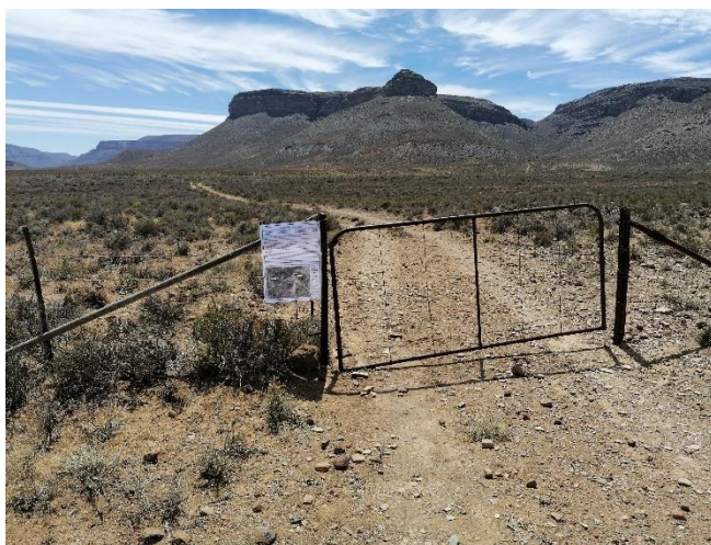
Photo 5: Access to boreholes Cal_S2_3 and Cal_S2_4 (Farm 854) (Taken from Point 5)