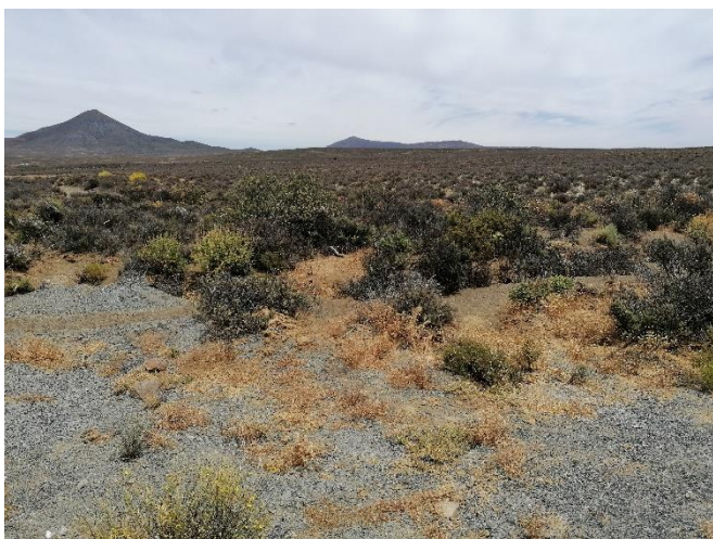
Photo 10: Approximate pipeline route between Cal_Phase3_9 and Ceres-Karoo BH (Taken from Point 8 looking south-west)