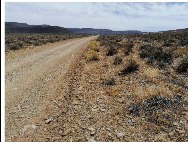
Photo 15: Pipeline route from Cal_Phase3_6 along the Toren Rd (AP2286) (taken from Point 12 looking south-west)