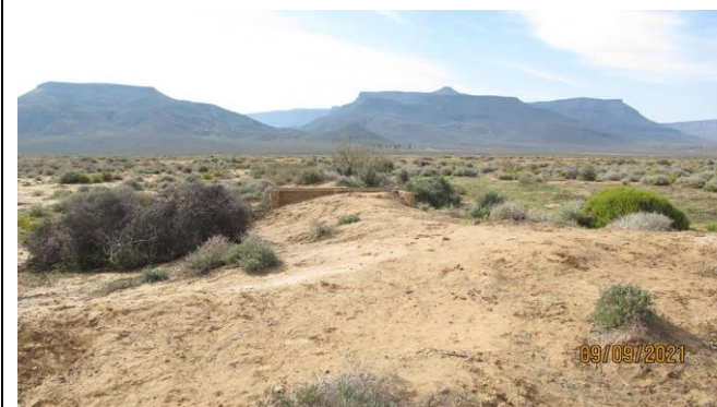
Photo 20: Taken from Point 16, looking north-east along pipeline route