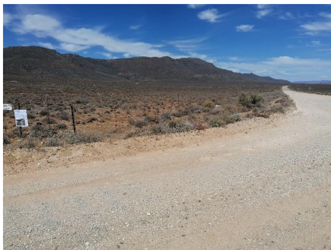
Photo 16: AP2286 and R355 junction, indicating the pipeline route (Taken from Point 13 looking south-east down the R355)