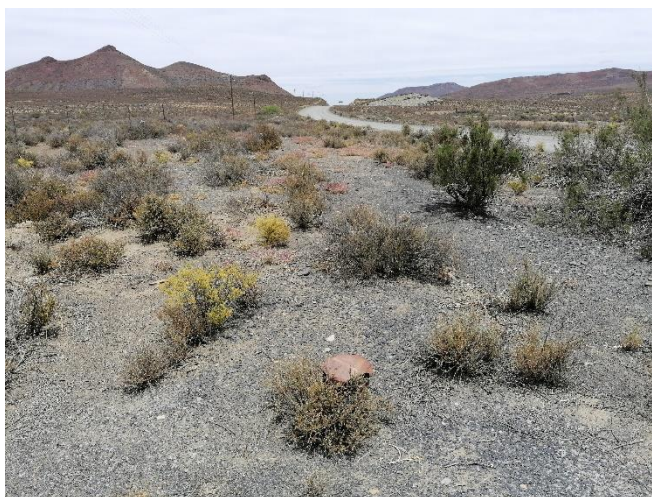
Photo 11: Ceres-Karoo BH (Taken from Point 9 looking south down the R355)