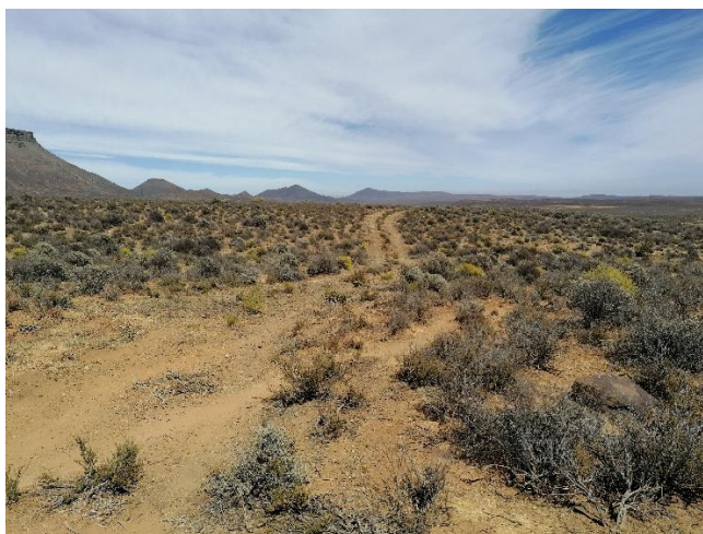
Photo 2: Access Road to borehole Cal_S2_3 and proposed pipeline route (Taken from Point 2)