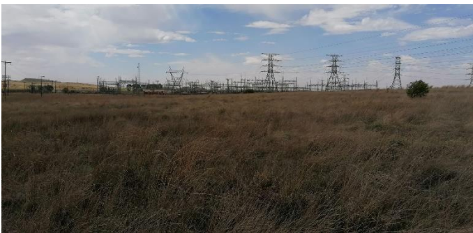
Photo 53: Taken from point 13, looking north towards the Harvard substation.