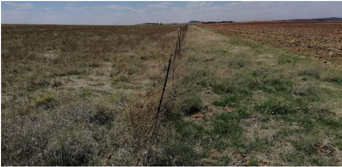
Photo 17: Taken from point 5, looking north over the proposed site.