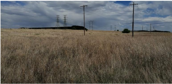
Photo 51: Taken from point 12, looking south-east over the proposed grid connection route and the existing powerlines.