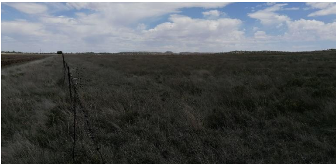
Photo 13: Taken from point 4, looking south-west over the proposed site.