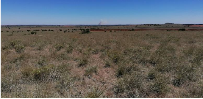
Photo 35: Taken from point 9, looking north-west over the proposed site.