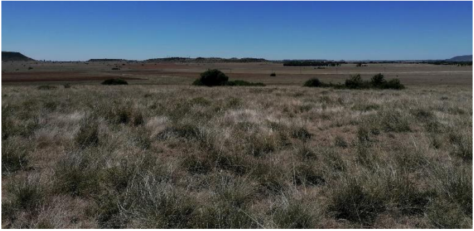
Photo 38: Taken from point 9, looking east over at the severely eroded drainage line.