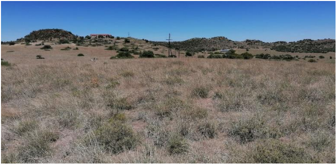
Photo 33: Taken from point 9, looking south-west over the proposed site. Neighbouring residence can be seen.