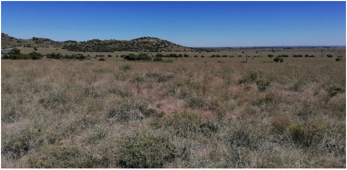
Photo 34: Taken from point 9, looking west over the proposed site and towards adjacent property.