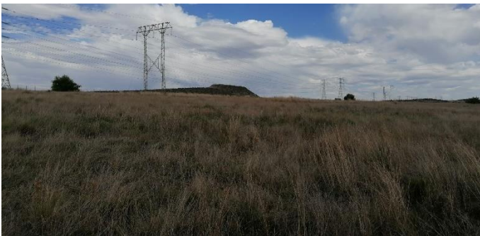
Photo 55: Taken from point 13, looking south-east over the proposed grid connection route and the existing powerlines.