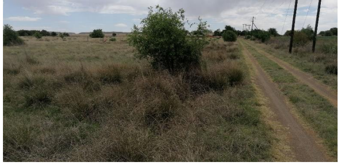
Photo 28: Taken from point 7, looking west over the proposed site.