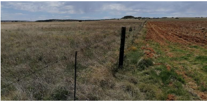
Photo 21: Taken from point 6, looking west over the proposed site.