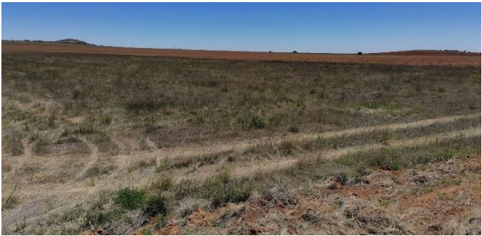
Photo 44: Taken from point 11, looking north-west over the proposed site.