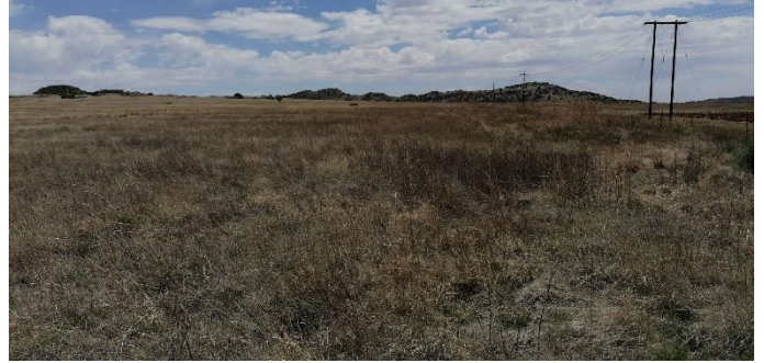
Photo 12: Taken from point 3, looking west over the proposed site.