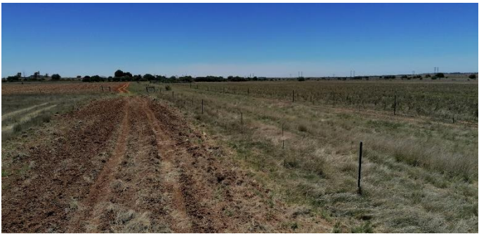
Photo 46: Taken from point 11, looking north-east over the proposed site.