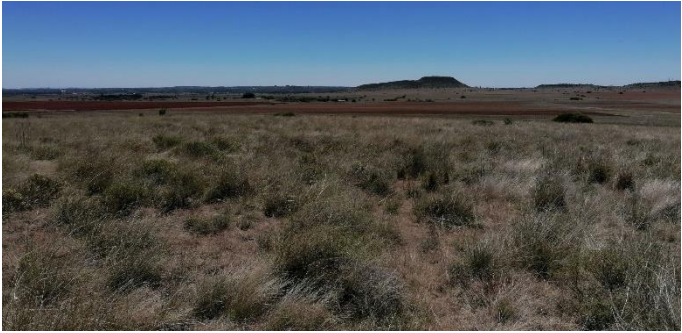
Photo 37: Taken from point 9, looking north-east over the proposed site.