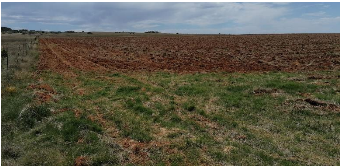
Photo 22: Taken from point 6, looking north-west over the proposed site.