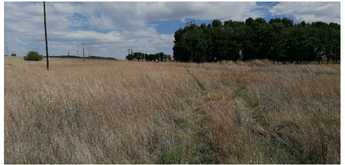
Photo 52: Taken from point 12, looking south down the proposed grid connection route.