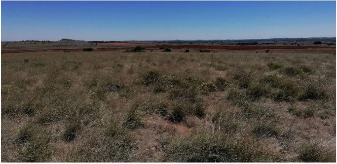
Photo 36: Taken from point 9, looking north over the proposed site.