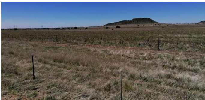
Photo 47: Taken from point 11, looking east over the proposed site.