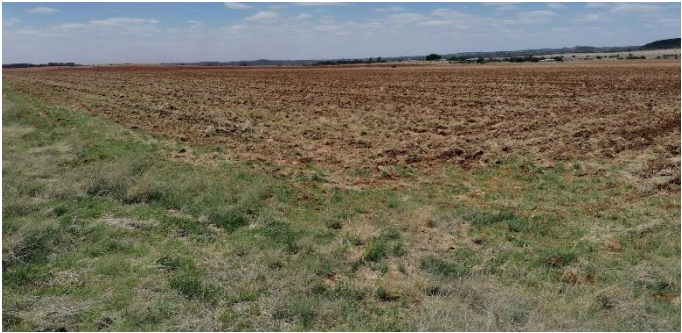
Photo 18: Taken from point 5, looking north-east over the proposed site.