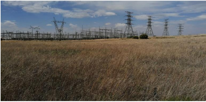
Photo 49: Taken from point 12, looking north at the Harvard substation.