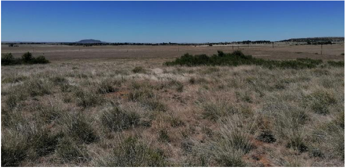
Photo 39: Taken from point 9, looking south-east over at the proposed site.