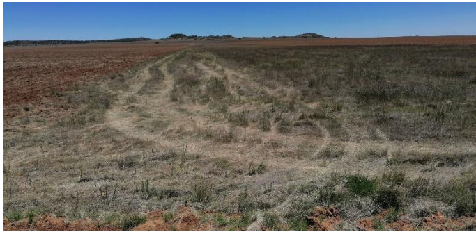
Photo 43: Taken from point 11, looking west over the proposed site.