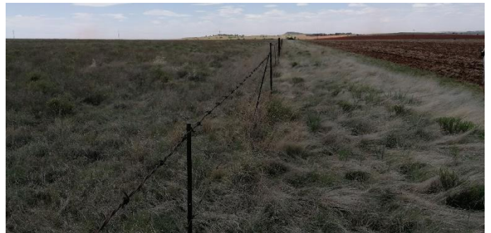
Photo 14: Taken from point 4, looking north-west over the proposed site.