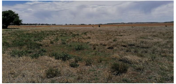
Photo 2: Taken from point 1, looking south-east over the proposed site.