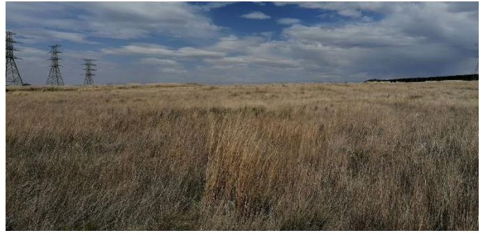
Photo 50: Taken from point 12, looking north-east over the proposed grid connection route.