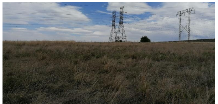
Photo 54: Taken from point 13, looking east at the existing powerlines.