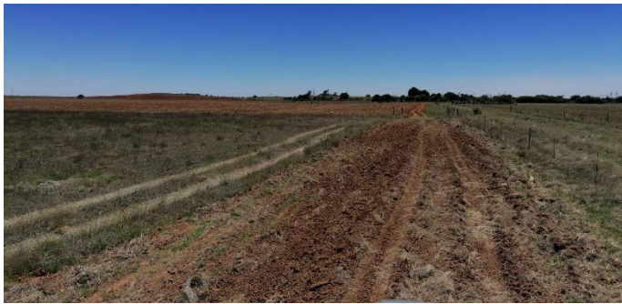
Photo 45: Taken from point 11, looking north over at the proposed site.