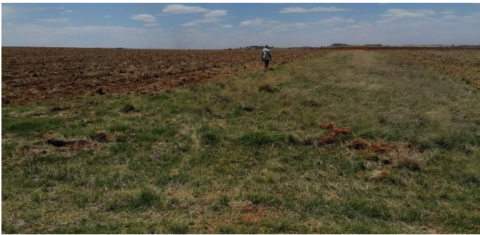
Photo 23: Taken from point 6, looking north-east over the proposed site.