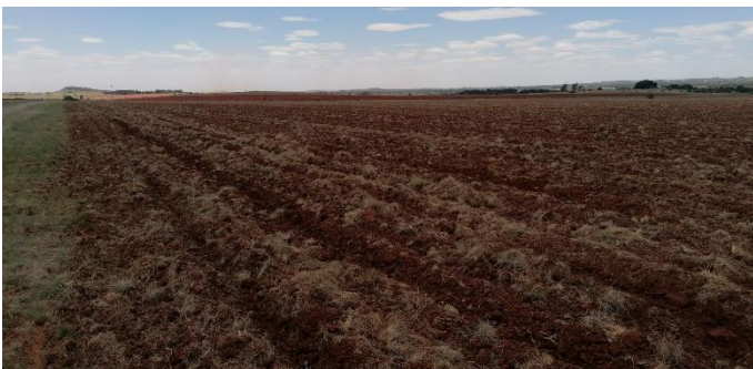
Photo 15: Taken from point 4, looking north-east over the proposed site.