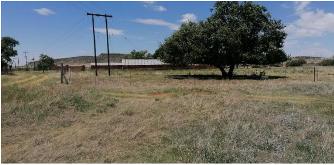
Photo 1: Taken from point 1, looking east towards the structures on the property