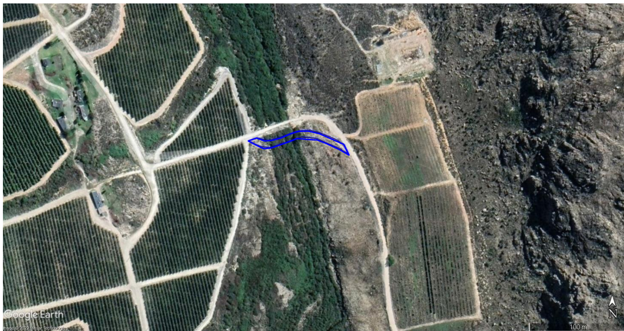
Figure 4: GOOGLE EARTH IMAGE INDICATING THE REALIGNMENT OF ROAD SECTION 1.