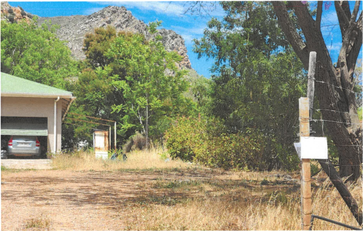
Photo 2: Public notice placed on gate of of house near Wittebrug WPP