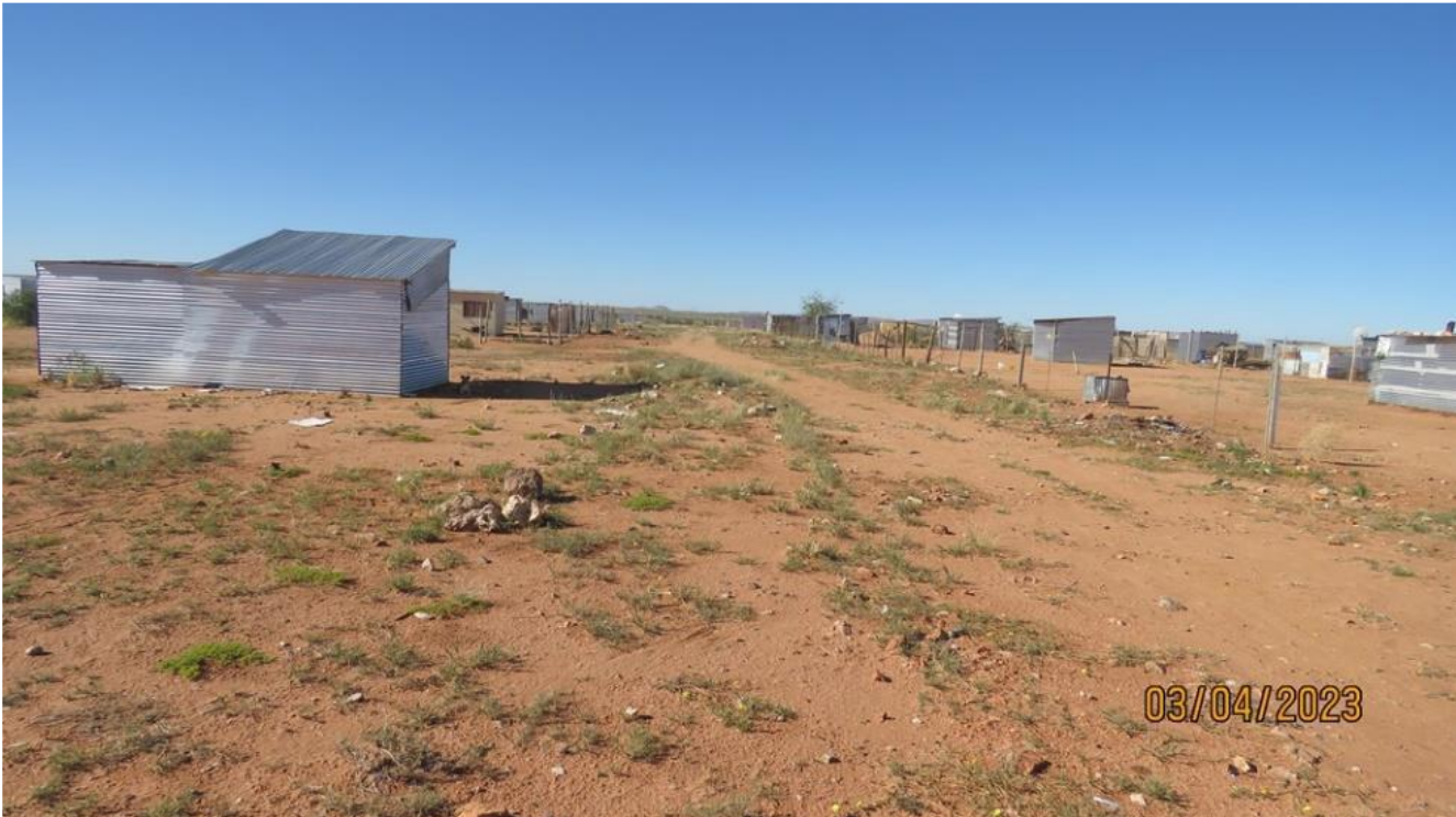
Photo 1: View of the southern portion of the existing on-site informal settlement