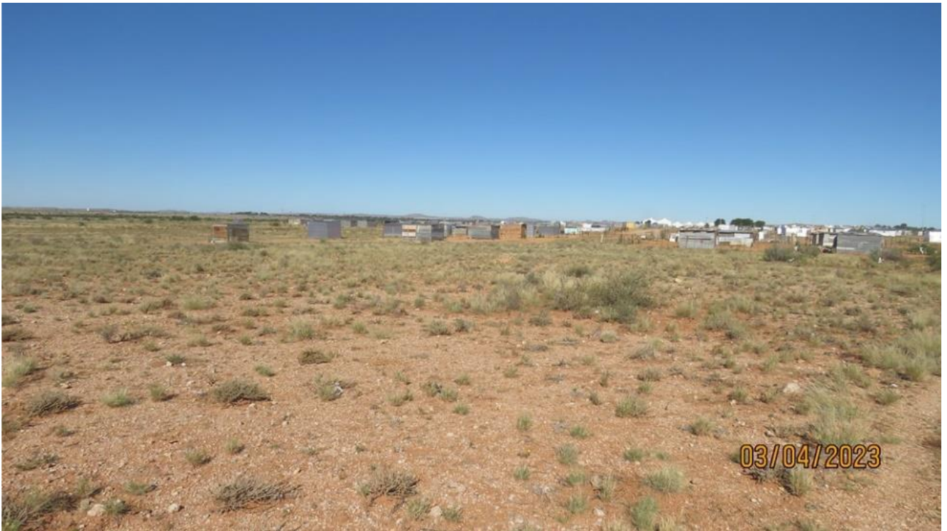
Photo 2: View of the vegetation that remains on the unoccupied portion of the proposed site