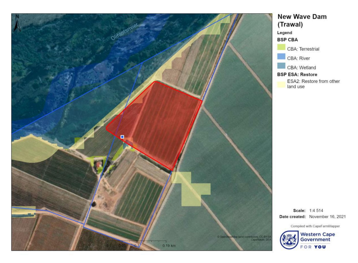
Figure 3: Critical Biodiversity Area ("CBA") intersecting the proposed site