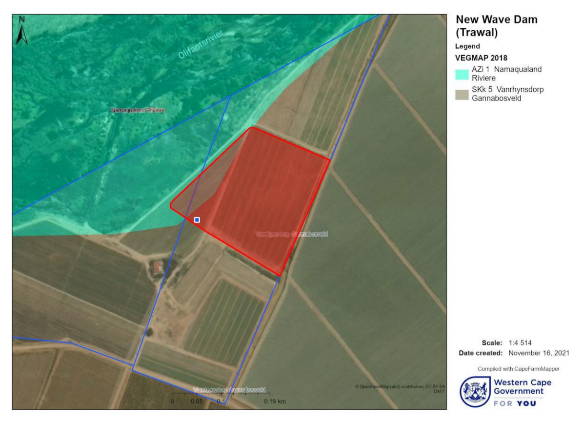
Figure 2: Vegetation types around proposed site (site is dark blue polygon)

According to the 2018 version of the Vegetation Map of South Africa, Lesotho and Swaziland (Mucina and Rutherford, 2006), the site is located within an area that historically would have been covered by Vanrhynsdorp Gannabosveld with Namaqualand Riviere vegetation dominating the riparian zone of the Olifants River (See Figure 3). Both these vegetation types are classified as "Least Threatened" in terms of the "List of ecosystems that are threatened and in need of protection" (GN 1002, December 2011), promulgated in terms of the National Environmental Management Act, Biodiversity Act, 2004 (Act No. 10 of 2004).