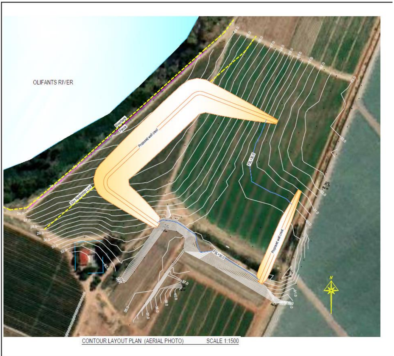
Figure 2: illustration of the proposed dam located on the right bank of the Olifants River

Water from the Bulshoek Water Canal will be directed into the proposed dam in terms of an existing water allocation granted by the Lower Olifants River Water Users Association (“LORWUA”) and stored during the rainy winter months for usage during the dry summer months to irrigate the vineyards and plantations on the farm via existing irrigation canals on the farm.