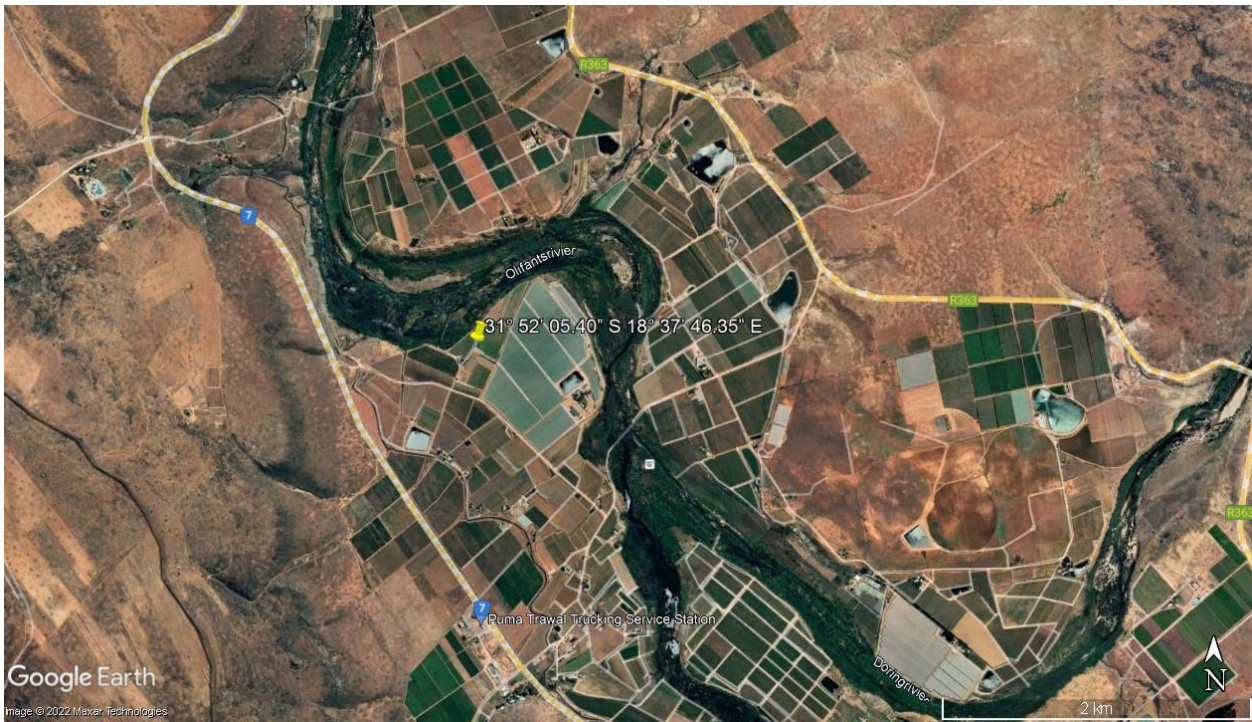
Figure 1: Google Earth aerial view of the proposed site (red line with yellow placemarks)