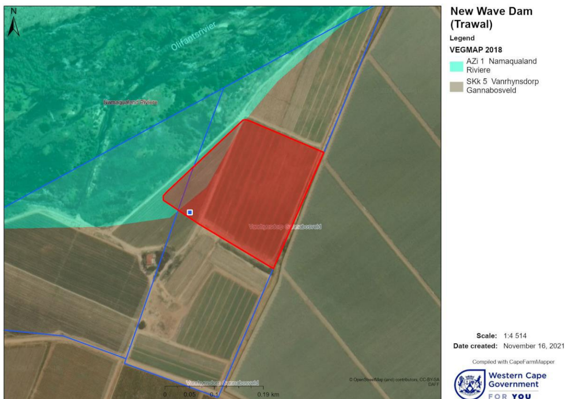
Figure 2: Vegetation types around proposed site (site is dark blue polygon)

According to the 2018 version of the Vegetation Map of South Africa, Lesotho and Swaziland (Mucina and Rutherford, 2006), the site is located within an area that historically would have been covered by Vanrhynsdorp Gannabosveld with Namaqualand Riviere vegetation dominating the riparian zone of the Olifants River (See Figure 3). Both these vegetation types are classified as “Least Threatened” in terms of the “ List of ecosystems that are threatened and in need of protection ” (GN 1002, December 2011), promulgated in terms of the National Environmental Management Act, Biodiversity Act, 2004 (Act No. 10 of 2004).