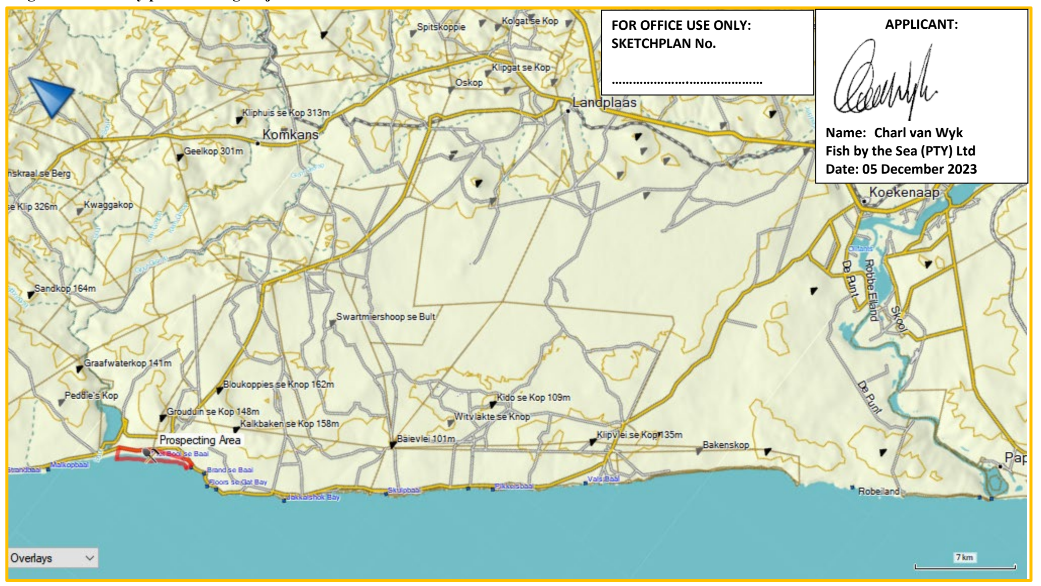
REGULATION 7(1)(b): PLAN CONTEMPLATED IN REGULATION 2(2) SHOWING THE LAND TO WHICH THE APPLICATION RELATES Figure 1a: Locality plan showing major routes and towns