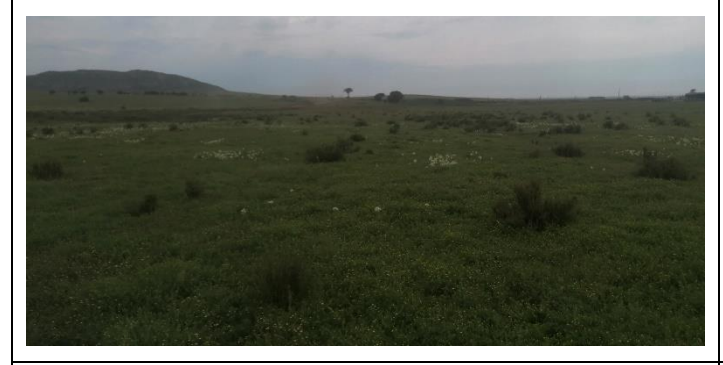
Photo 3: Taken from point 1, looking east over the proposed site (eastern section).