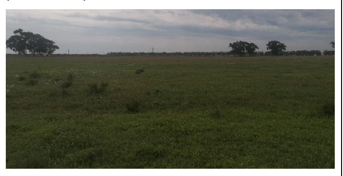
Photo 5: Taken from point 1, looking south over the proposed site (eastern section).