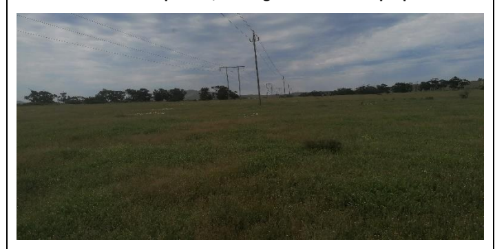
Photo 11: Taken from point 3, looking west over the proposed site.