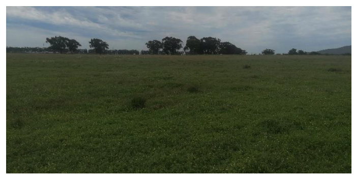
Photo 6: Taken from point 1, looking south-west over the site (eastern section).