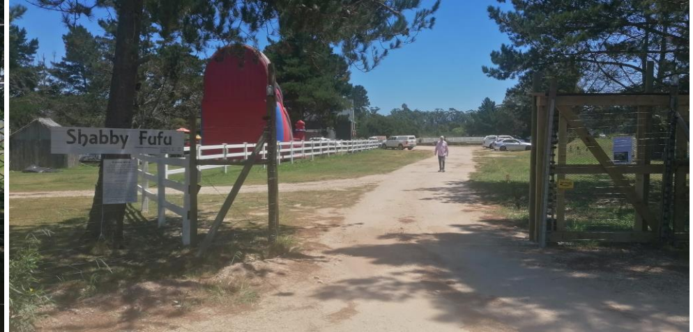
Photo 2: Site notice placed at the eastern entrance gate, just of the N2