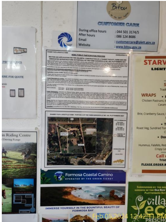
Photo 5: Site notice placed at the Bitou Municipality Office notice board