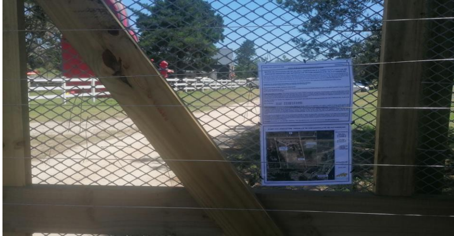
Photo 1: Site notice placed at the eastern entrance gate, just of the N2