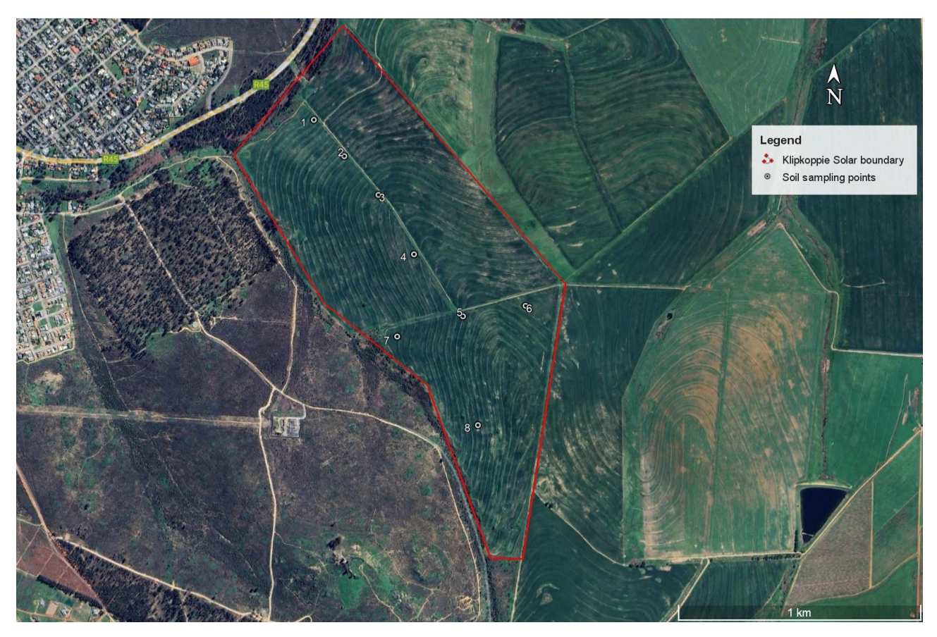
Figure 3. Satellite image map of the development.

The agricultural protocol requires the current productivity of the land based on detailed production figures and it requires the current employment figures. The land is municipally owned and was previously rented to a farmer but has not been rented or used for agricultural production for several years.