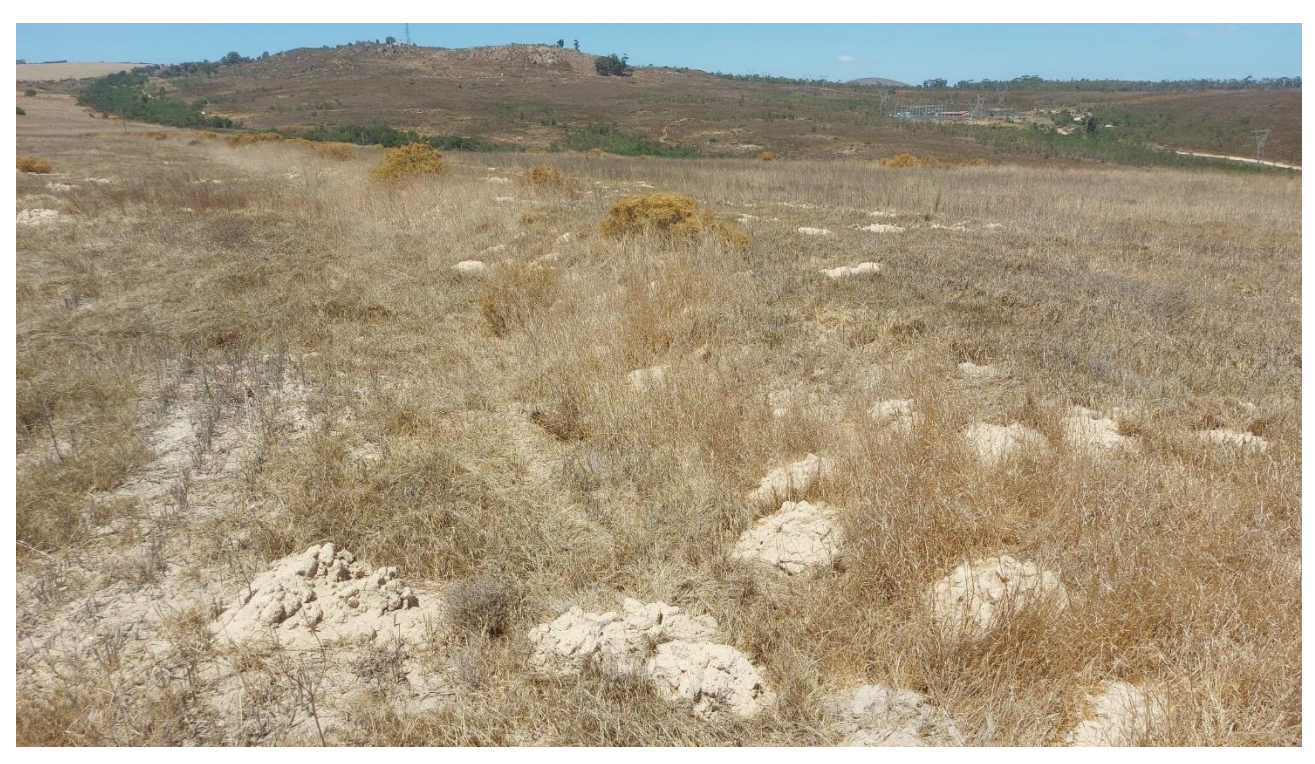
Figure 4. Typical site conditions showing the very sandy upper soil horizons in the mole hills.

Although viable rain-fed cropping may have been done on the site in the past, the marginal potential makes it high risk economically. It should be noted that cropping potential changes with a changing agricultural economy over time. Poorer lands that may have been cropped with economic viability in the past, are abandoned as cropland because they become too marginal for viable crop production in a more challenging agricultural economy, with increased input costs.