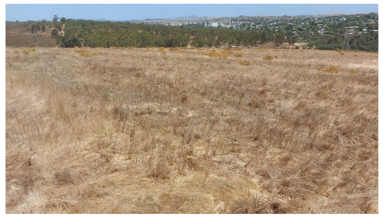
Figure 5. Typical site conditions looking down the site towards Malmesbury.