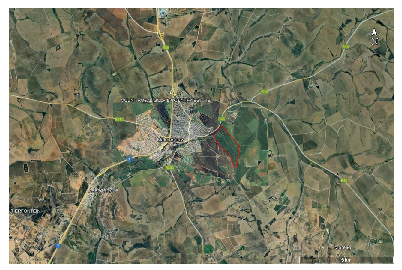
Figure 1. Locality map of the development on the southwestern outskirts of the town of Malmesbury.

Environmental and change of land use authorisation is being sought for the proposed Klipkoppie PV solar plant on remainder of Erf no. 327, Malmesbury, Western Cape (see location in Figure 1). In terms of the National Environmental Management Act (Act No 107 of 1998 - NEMA), an application for environmental authorisation requires an agricultural assessment. In this case, based on the high agricultural sensitivity of the assessed area by the screening tool (see Section 7), the level of agricultural assessment required by the protocol is an Agricultural Agro-Ecosystem Specialist Assessment.