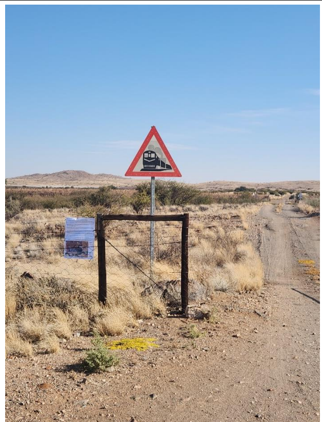
Photo 4: Proof of Site Notice placed at the access road to Portion 46 towards the train tracks