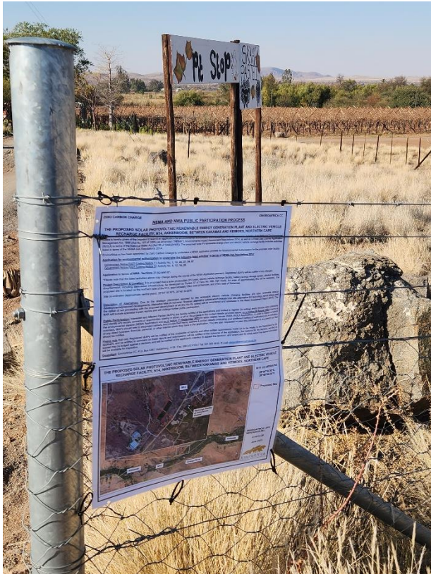
Photo 1: Site Notice Placed at the entrance of the Akkerboom Padstal