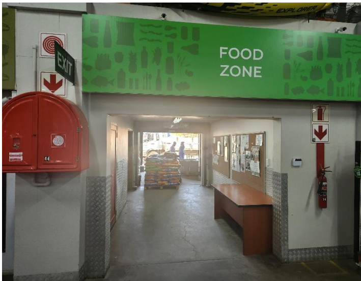
Photo 11: Proof of Site Notice Placed at the entrance of AgriMark Kakamas