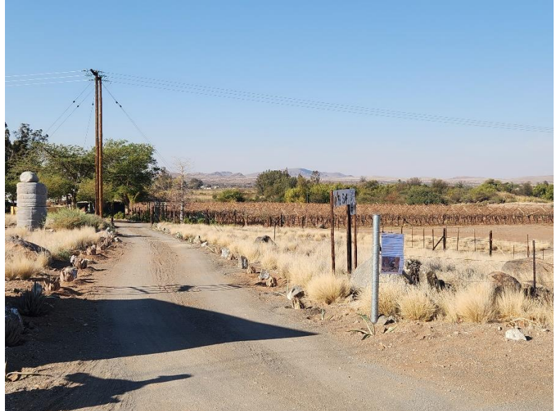
Photo 2: Site Notice Placed at the entrance of the Akkerboom Padstal