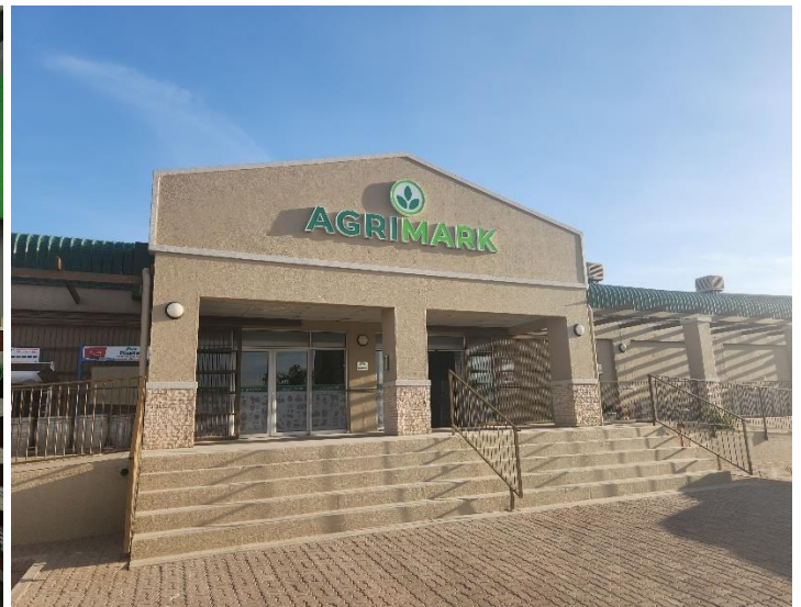
Photo 12: Proof of Site Notice Placed at the entrance of AgriMark Kakamas