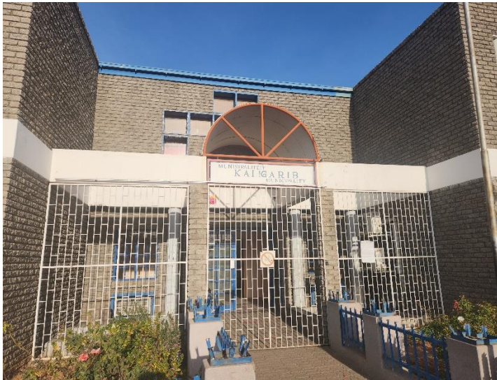
Photo 9: Proof of Site Notice Placed at the entrance of The Kail Garib Municipality Offices in Kakamas