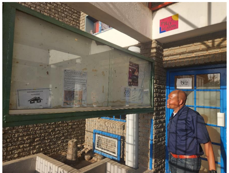
Photo 8: Proof of Site Notice Placed at the entrance of The Kai! Garib Municipality Offices in Kakamas