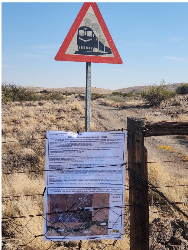
Photo 3: Proof of Site Notice placed at the access road to Portion 46 towards the traintracks