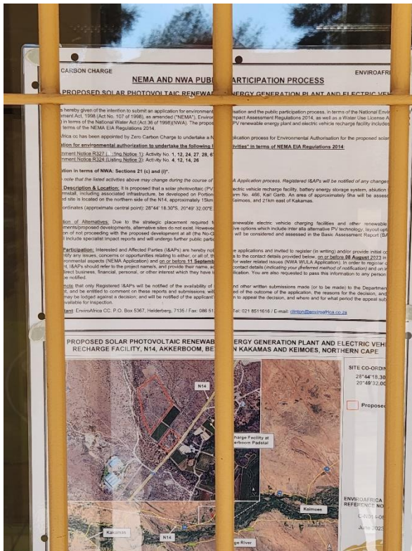
Photo 5: Proof of Site Notice Placed at the entrance of AgriMark Keimoes