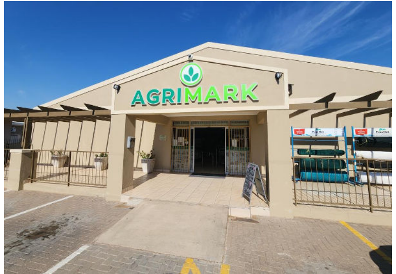
Photo 6: Proof of Site Notice Placed at the entrance of AgriMark Keimoes