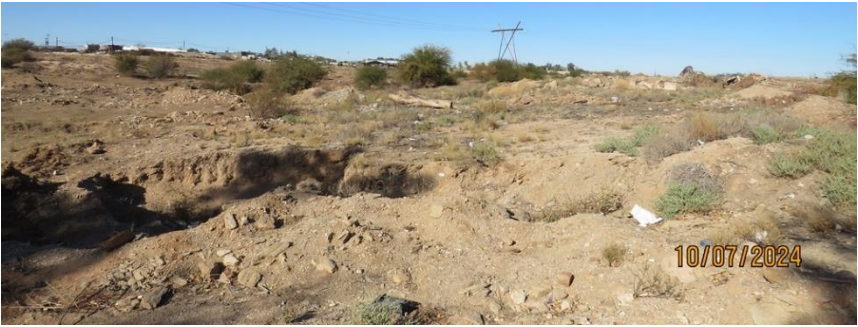
Photo 2. View of existing excavations that form part of site disturbance