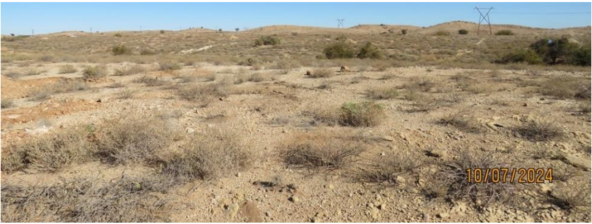
Photo 1. View of the proposed site indicating sparse vegetation