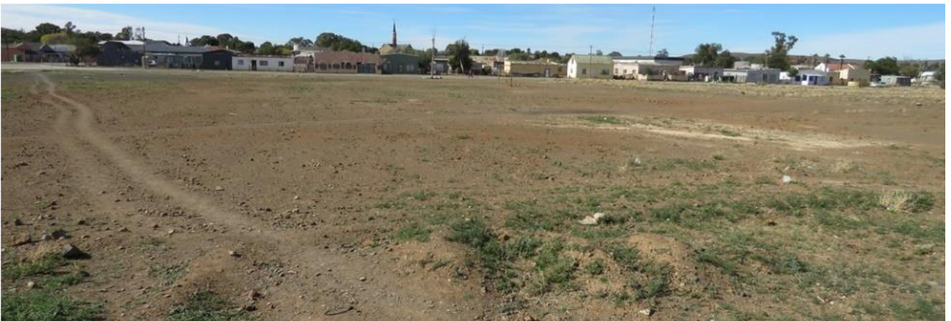
Photo 2: View of the soccer pitch towards the north-eastern parts of the proposed site