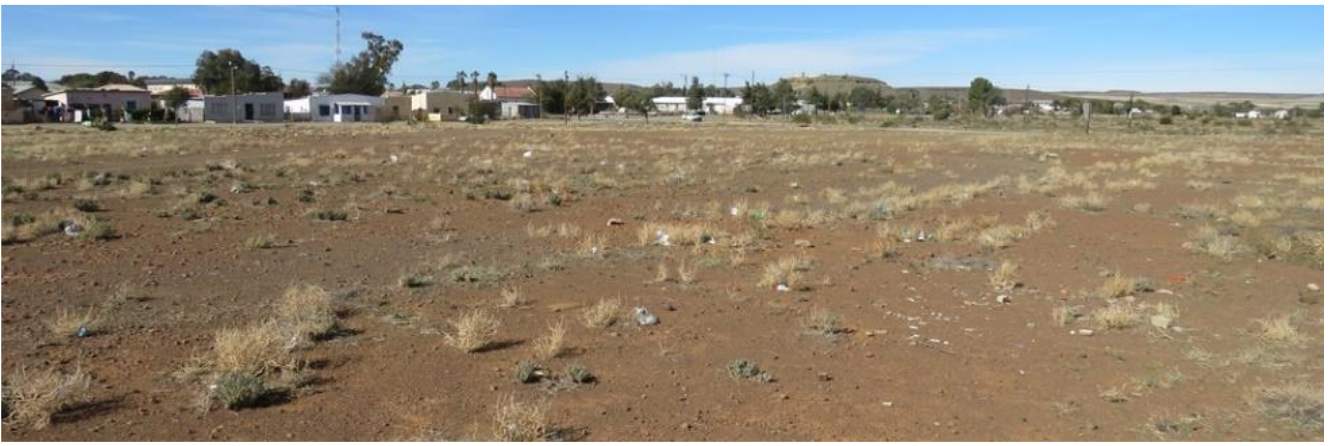
Photo 1: View of the disturbed south-eastern parts of the proposed site