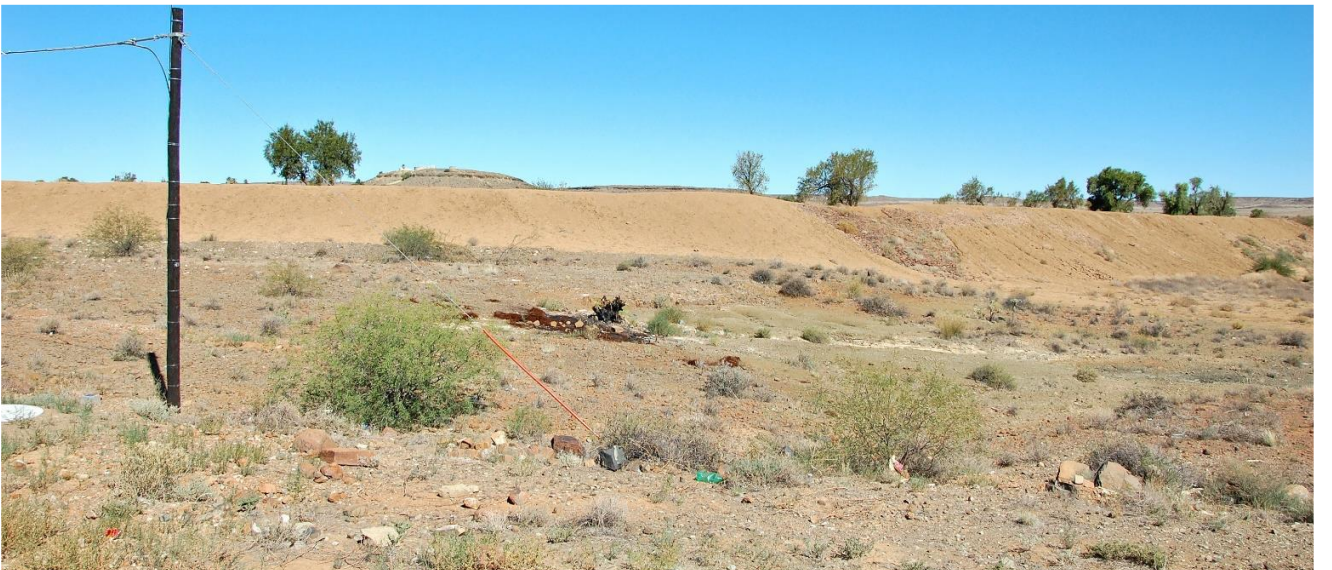
Photo 3: View of the wall of the dam located approximately 100m south of proposed site