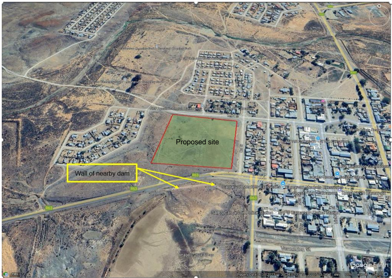
Figure 1: View of the proposed site (red polygon) and surroundings

All the investigation reports compiled by specialists and the letters of comment obtained from the relevant Organs of State will be responded to and included in the Basic Assessment Report.