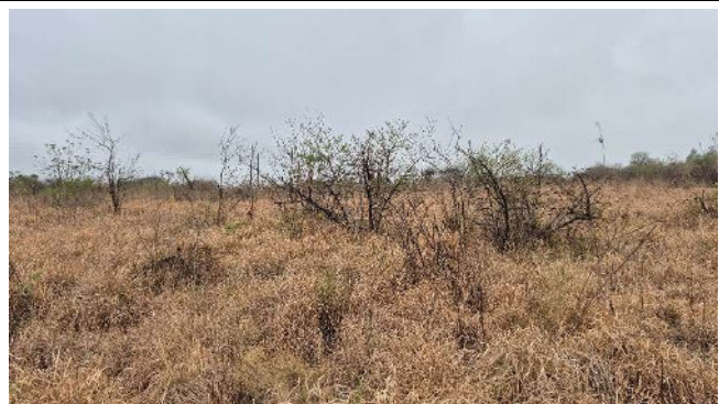
Photo 6: Image of the proposed site, looking east at proposed site from Point 3