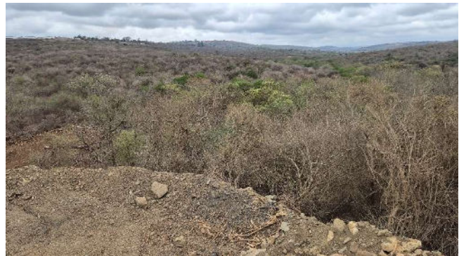
Photo 2: Image of the proposed site taken from Point 1 looking south-west.