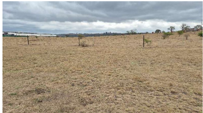
Photo 4: Image of the proposed site taken from Point 2 looking west.