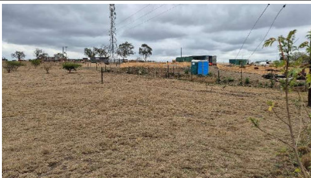
Photo 5: Image of the proposed site, looking north at proposed site from Point 2