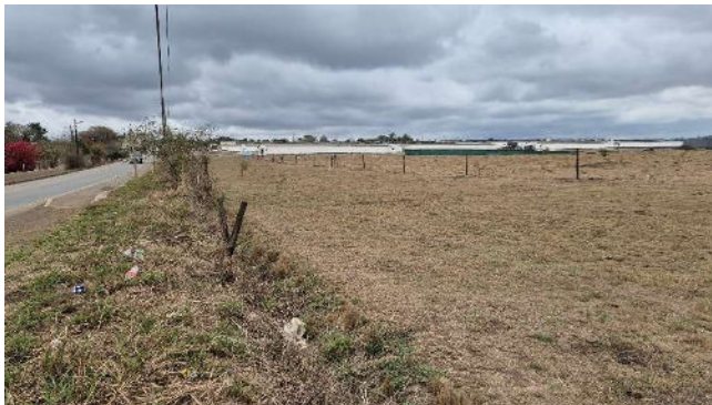
Photo 3: Image of the proposed site taken from Point 2 looking south-west.