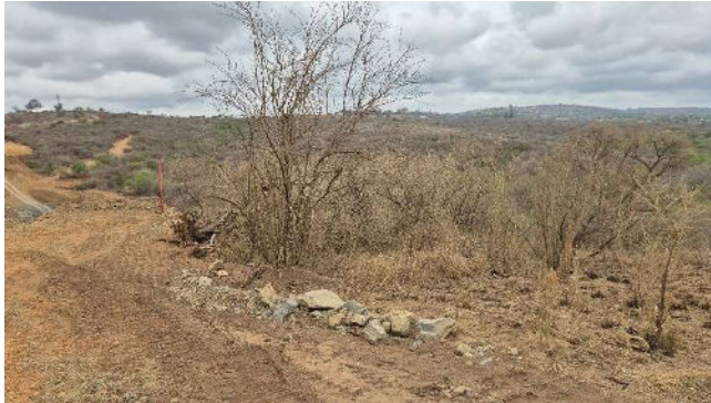
Photo 1: Image of the proposed site taken from Point 1 looking south-east.