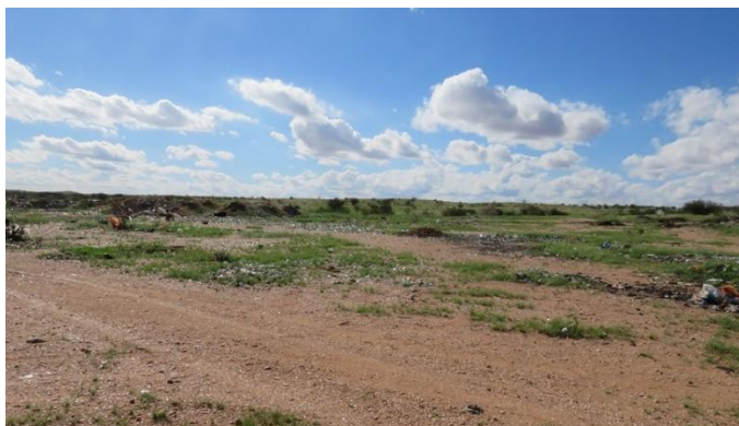
Photo 2: Image looking south to north from the centre of the proposed site.