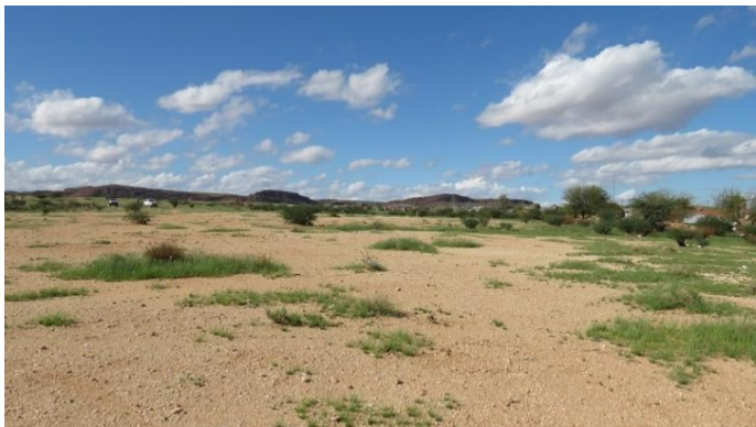
Photo 1: Image looking south to north from the southern boundary of the proposed site.