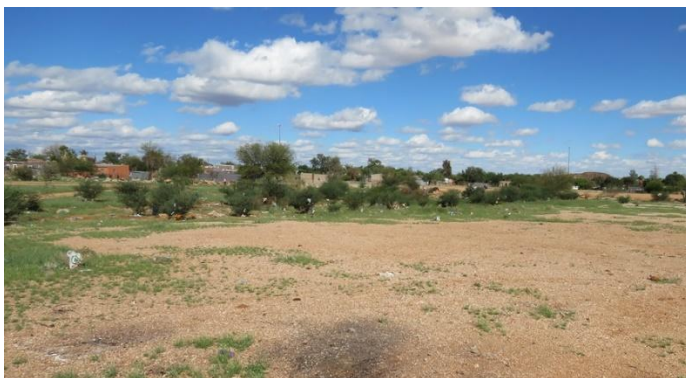
Photo 4: Image looking north to south-east from the centre of the proposed site.