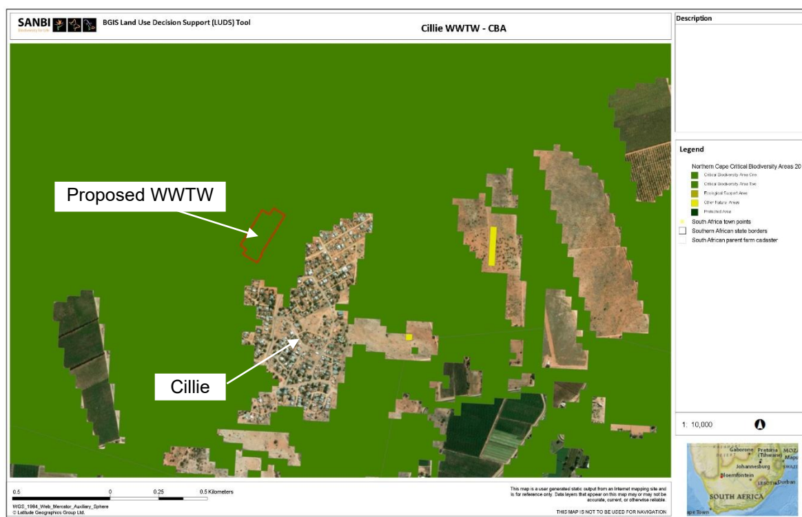
Figure 2: SANBI BGIS image of the CBAs in and around Cillie